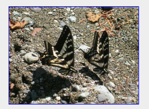
Sun bathing butterflies