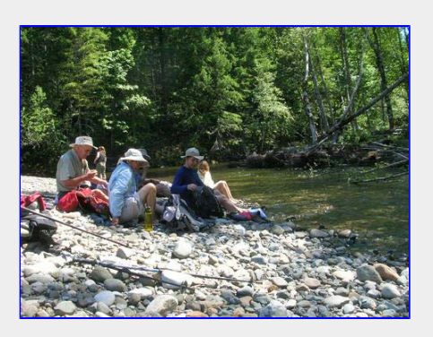
Lunch spot on the river