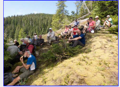
The two groups enjoy a break in the shade