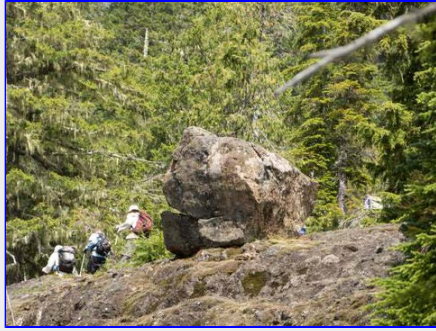
Turtle rock