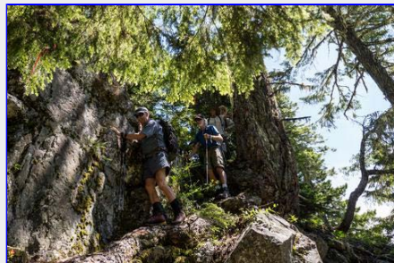
One slightly awkward section on the Capes Lake trail

It was also appreciated the Ken spent time clipping out the trail and adding new tree markers where appropriate. Thanks for your good work Ken.