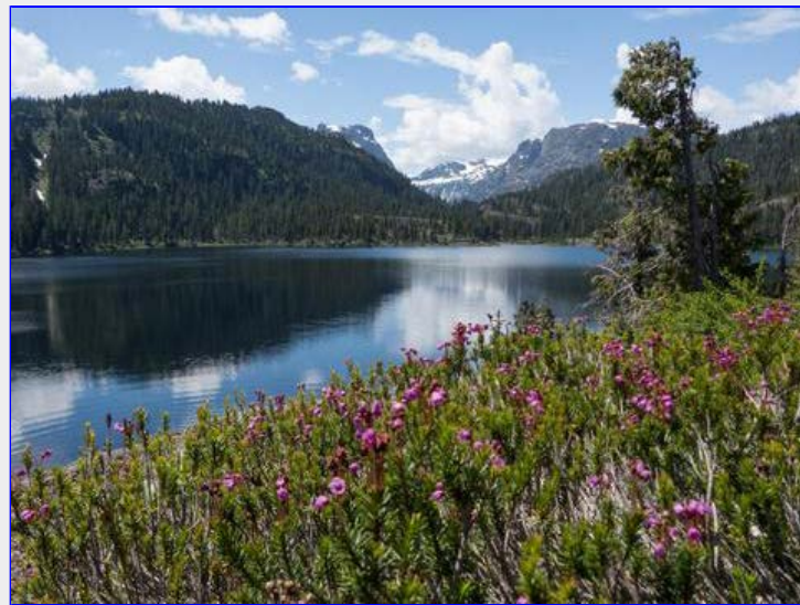
The heather was beautiful