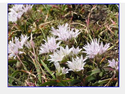
Olympic Onion