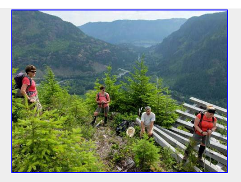
Heading up.... first logging helicopter pad... now a bit of a relic