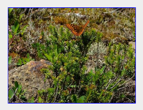
I spent about 10 minutes trying to capture this beauty... (digitally of course)