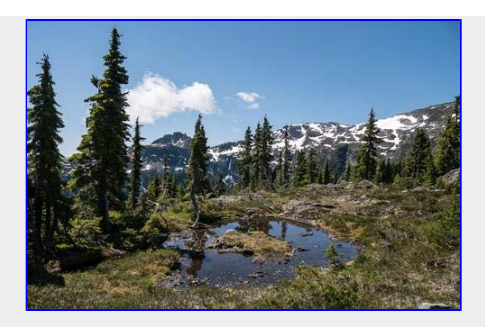
Castlecrag and Frink