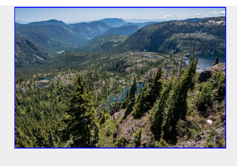
View to Moat Lake and the Cruickshank Canyon