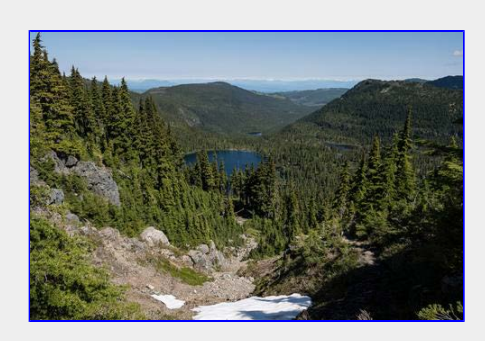
Looking back down the rocky gully leading up to Half Dome