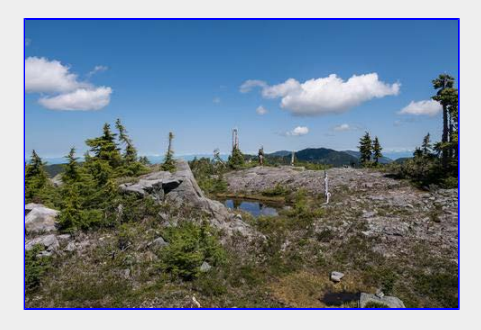
Half Dome lunch spot