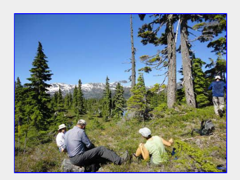
Morning Break at Hairtrigger Lake