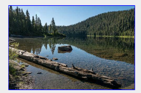
Early stop at Lake Helen Mackenzie