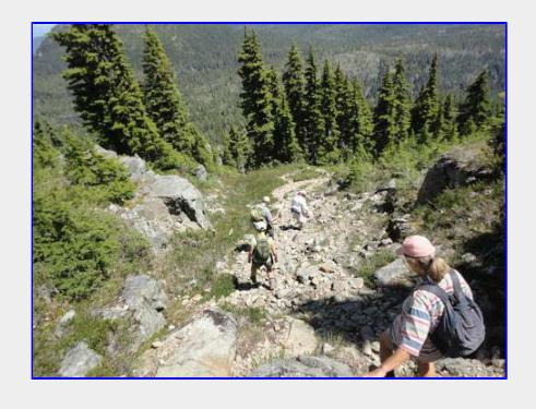
Heading back down