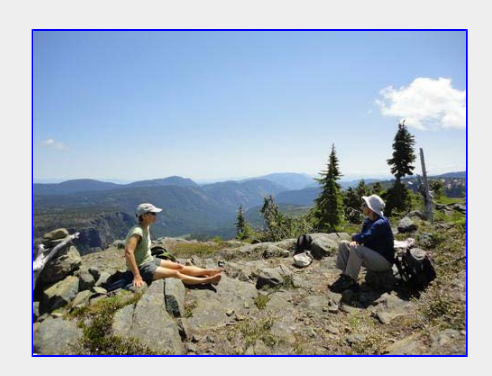
Lunch Break on Half Dome