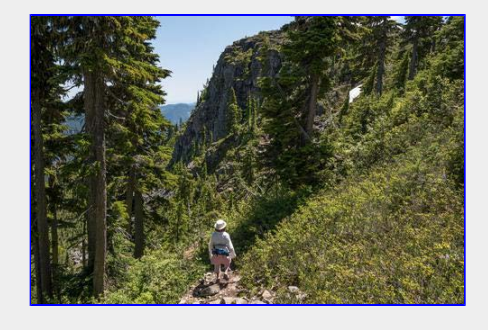
Heading down on the easier route