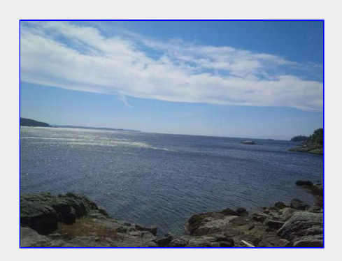
[Juanita Wells photo]