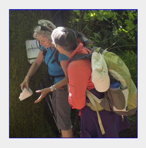
Geo Cache treasures.