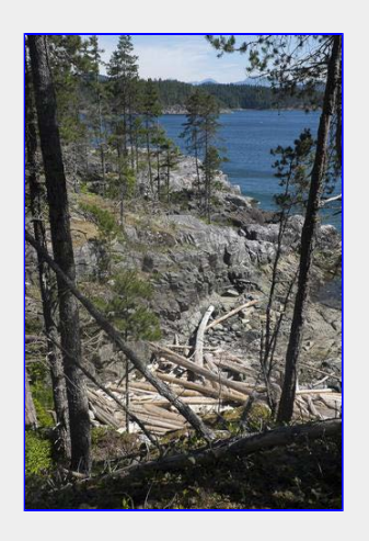
Looking towards Read Is.