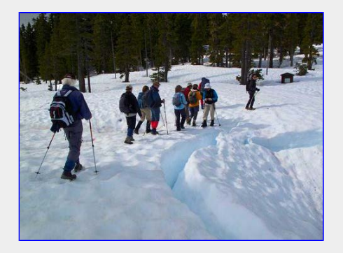
Snowbanks collapsing at Paradise Meadows