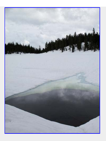
Cloud reflections in meltwater on Battleship Lake