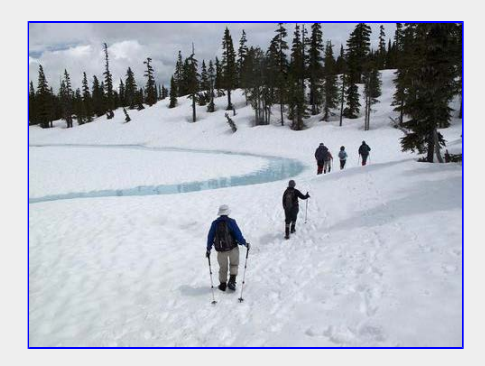
Cerulean blue edge of Ball Lake