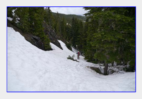
Heading down the gully from the east ridge above Croteau Lake