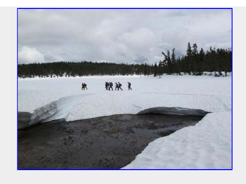
Crossing Lady Lake