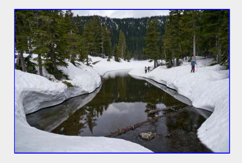
On the summer trail at the east side of Lady Lake