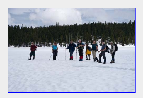
Lady Lake lineup