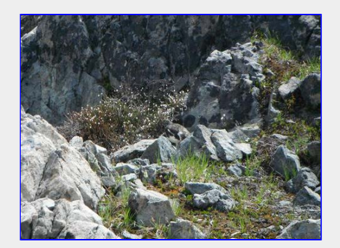
Find the Ptarmigan

Driving distance..... About 150 kms each way. ( 300 kms total) Starting elevation was 611 meters, Summit was 1,533 meters Approx. 922 meters in elevation gain. Trail distance by GPS was 3.20 kms, one way. So rounding it off to 6.50 kms for a round trip. Thanks Ron for leading this one, Another new one for myself.