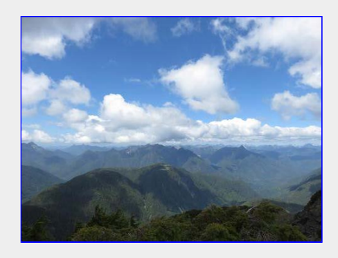
View North (East) from the summit