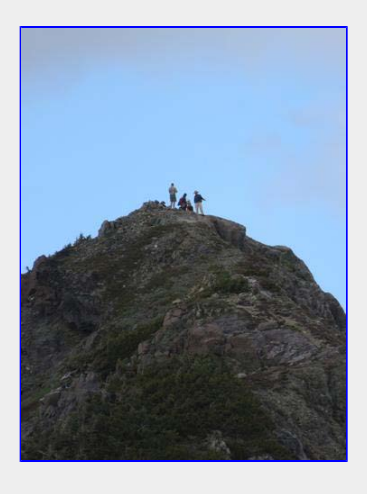
Looking across peak to peak