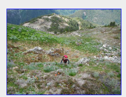
Nearing summit from upper meadows on north ridge