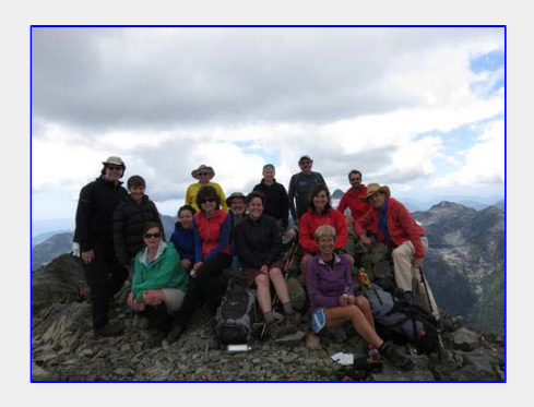
Group shot at the summit