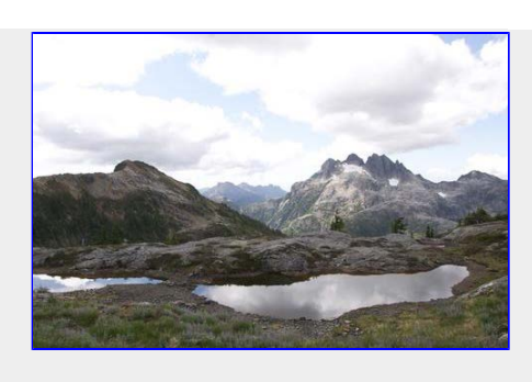
What a view!!