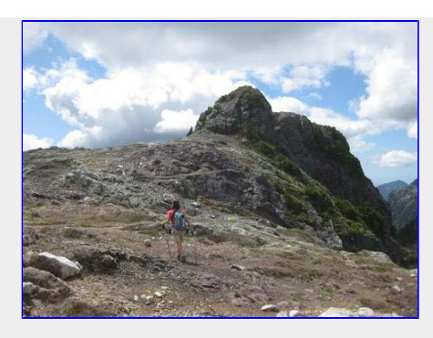
onwards and upwards