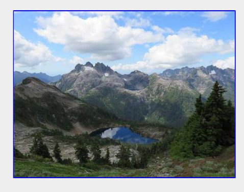
The view of where we were