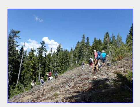
We are almost on the top!