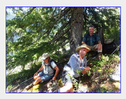
Rest and shade! It is hot!