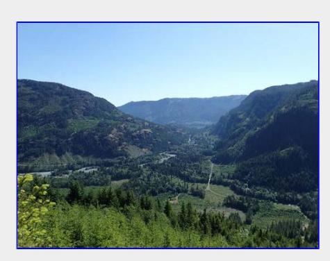
We have already a nice view to Alone Mtn. and Cruickshank River from the helicopter landing place