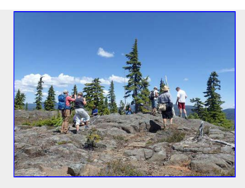
We made it. We are on the top of Mtn. Ginger Goodwin.