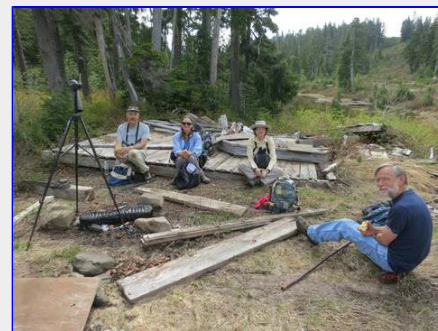
fancy lunch spot