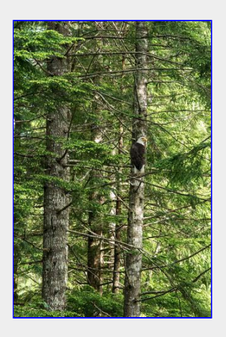
Scavenging eagle spotted near Wolf Lake