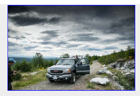
Ominous clouds on our way to the trailhead