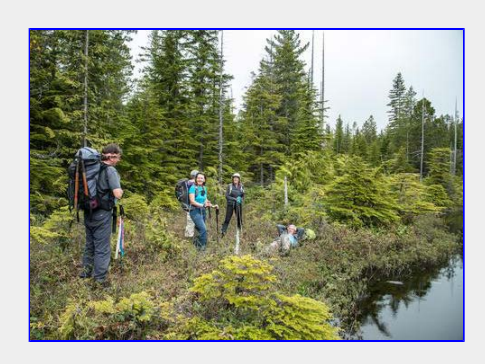
Relaxing at the lake