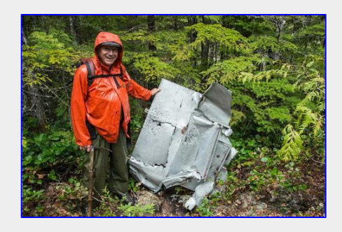
Old aircraft parts found laying around