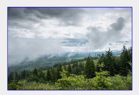
Stormy condition on the way home