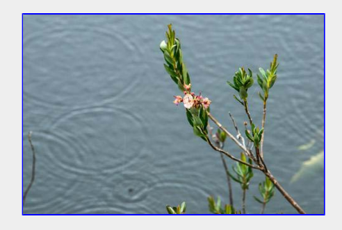
Kalmia flower at Kalmia Lake