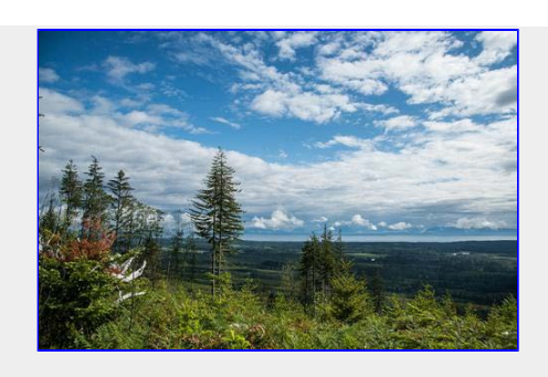
Nice clouds and sunny for a few minutes