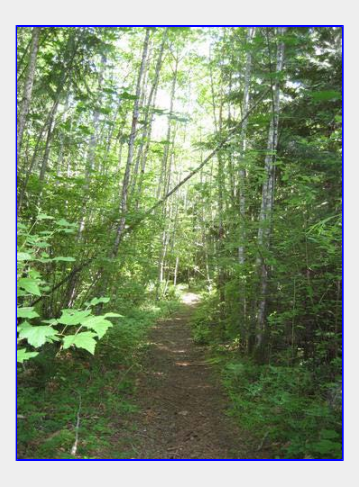
Trail behind Arden Elementary School