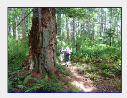
A trail through Millard Piercy Nature Park