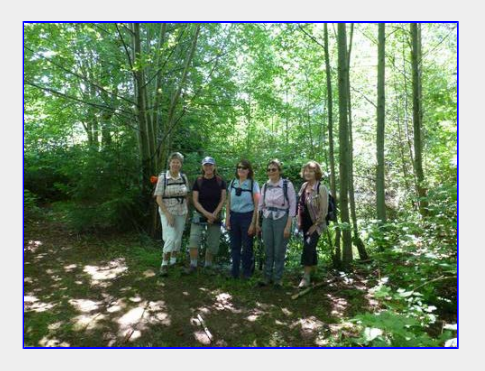
A leafy bower along the Comox Logging Road

The weather cooperated and we had a lovely day for an urban ramble with seven walkers. We started at the train station on Cumberland Road in Courtenay and did a wide circle of various trails, roads, paths, and railroad tracks in the southwest area of Courtenay. The parks we passed through included Puntledge Park, Masters Greenway, Capes Park, Millard-Piercy Nature Park, Airpark, and Bill Moore Park. I really enjoy taking people on urban explorations and showing them the connections between many of our trails and green spaces in the Comox Valley.