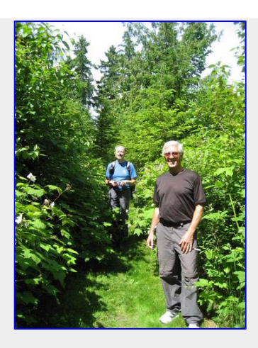
The Dons