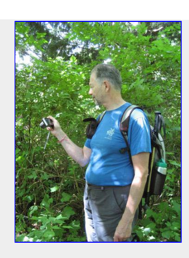
Don's new camera/GPS says we're in Nanaimo.