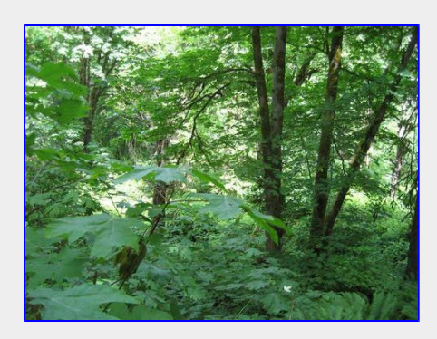
In Millard Piercy Nature Park