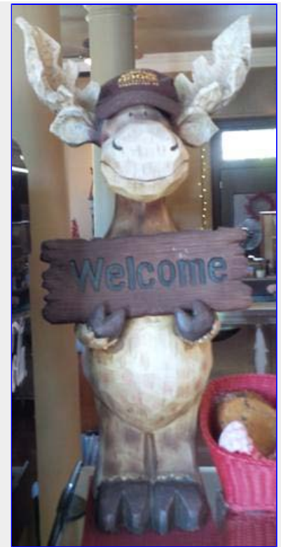
The "Wandering Moose" at the cold treats parlour