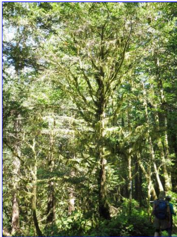
Amazing number of Yew trees in the area, saw dozens of them