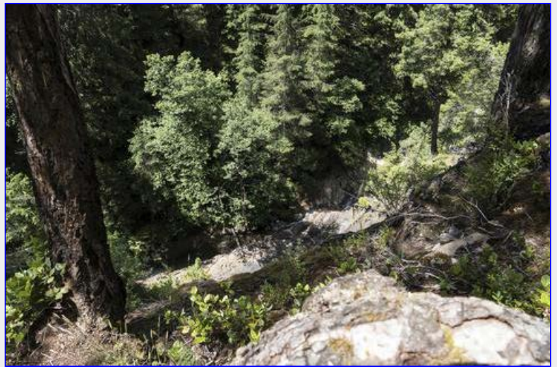
View of Perseverance Creek from Bronco's trail