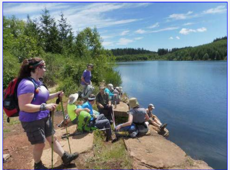
Lunch at Allen Lake