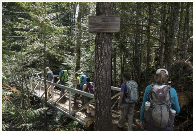
Crossing the Sykes Bridge