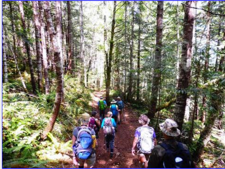
[Ed Tickner photo]