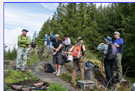
First stop at old forestry lookout