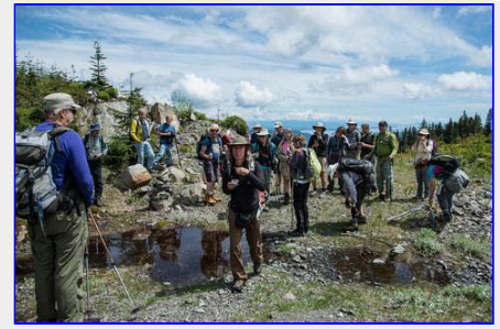
Hikers herding before heading down the hill