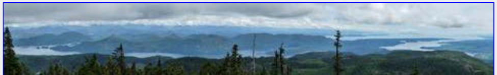
Great view from the top