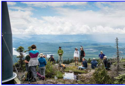
Lunchbreak spot