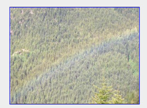
Rainbow... Lucky Charm