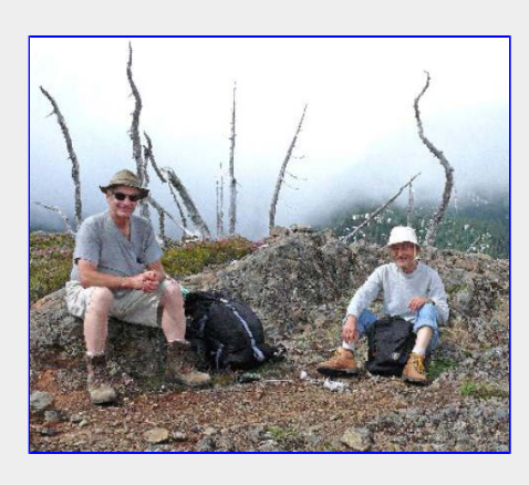
Recharging the Batteries