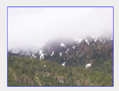
Shrouded Wall of the Southern Beauforts