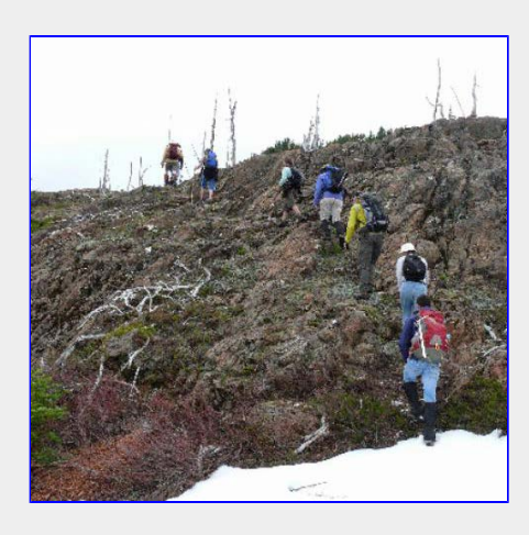
Travelling Thru Forest Fire Remnants