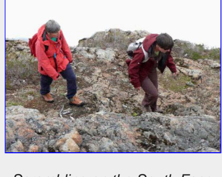
Scrambling on the South Face of Curran