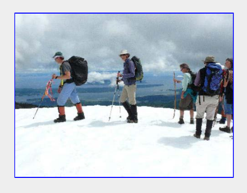
Walking the Snowy Summit