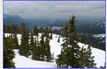
Looking south to Comox Lake and Alone Mountain