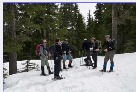
Brief stop for gear adjustment