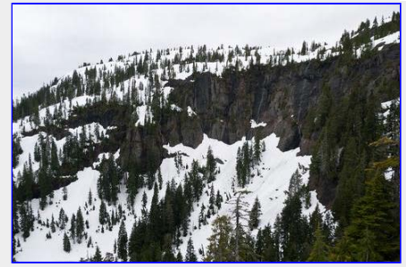
Not much snow melt coming off the ridge