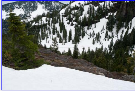
Boston Lake still covered in ice and snow