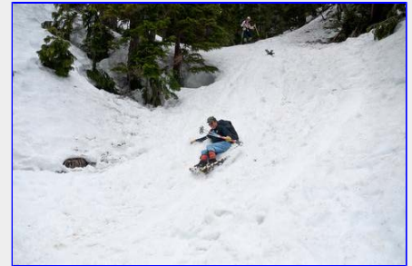
The quickest way down on steep sections