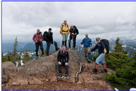
Mount Beecher summit and lunch stop