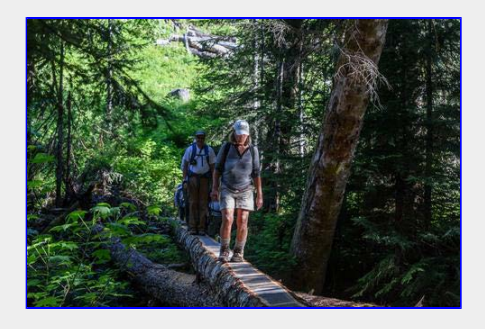
Crossing Comox Creek at the start of the trail

http://public.fotki.com/TimPenney/cdmc-trips/century-sam-lake-ju/