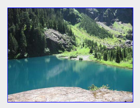
what a colour!

At the back end of the cave open to the creek and rocks above