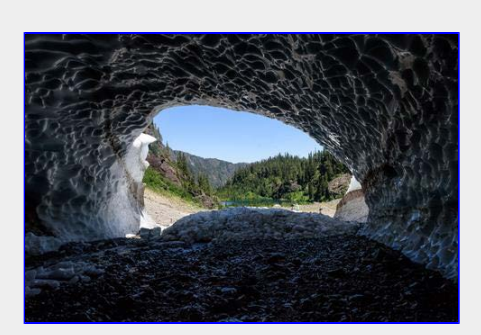
Looking out