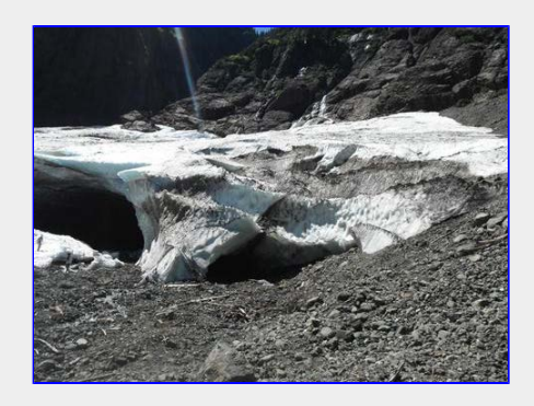
The one snow cave. Note the members on the left side.

At the back end of the cave open to the creek and rocks above