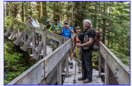
The bridge over Butterwort Creek