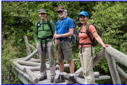
The bridge crossing Landslide Lake outflow creek