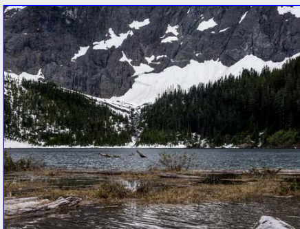
Almost a Bev Doolittle image - see the smiling dog face complete with an eye?