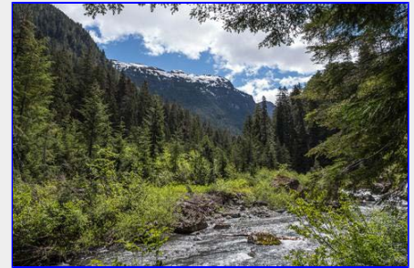
The Elk River