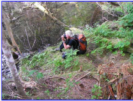
Artiste at Work