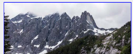
Colonel Foster ridges and the landslide area