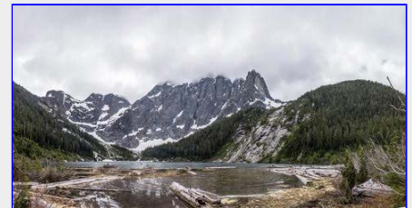
Panorama of Landslide Lake