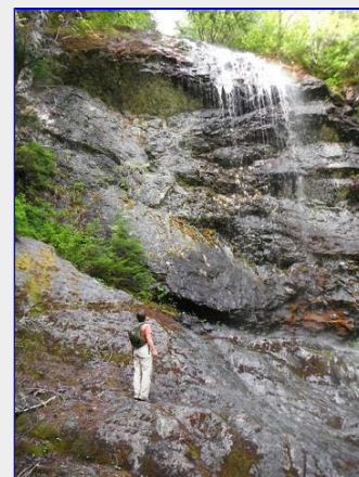
Spray Refresher