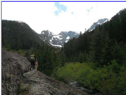
Ascending Approach