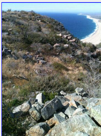
Lobos Mt, Todos Los Santos MX