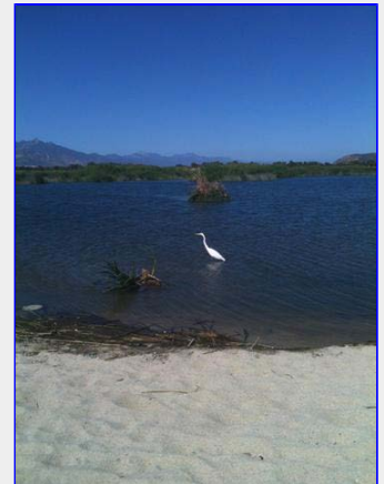
San Jose Del Cabo Estuary, Baja Sur MX