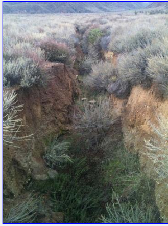
Earthquake Fault in San Gabriel Foothills CA