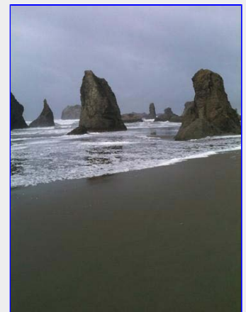
Sea Stacks on Southern Oregon Coast