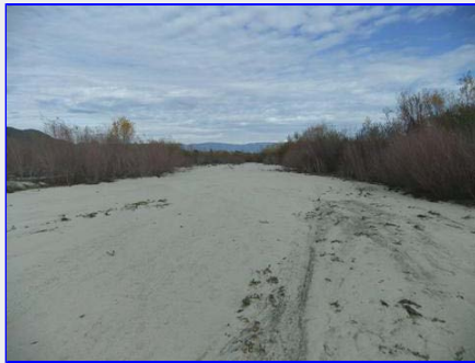
Santa Anna River Trail CA