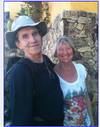
The Adventurers