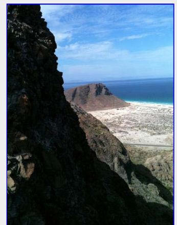
Tecolote Mt, La Paz MX