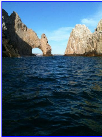
Pacific meets Cortez Sea at El Arco, Cabo San Lucas MX