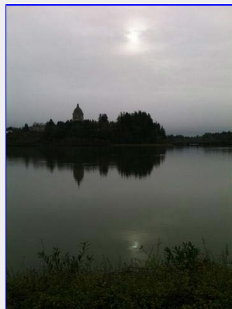
Olympia WA Capitol Lake