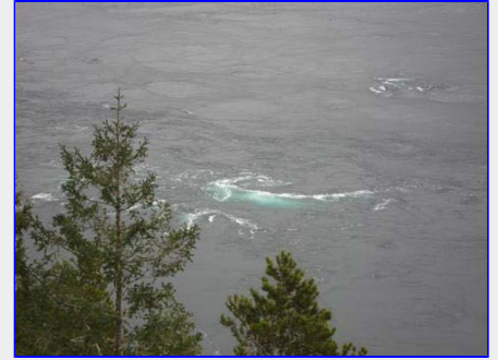
Seymour Narrows - Eddys and Currents