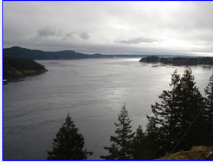
Seymour Narrows