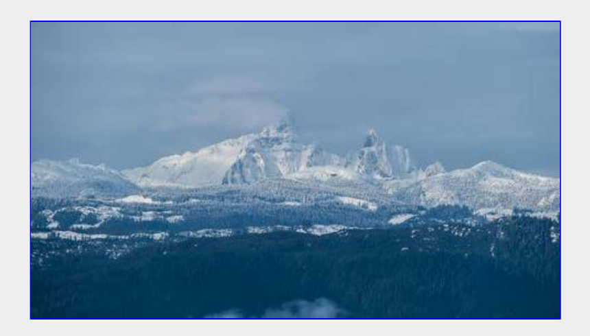
Victoria Peak from the old lookout