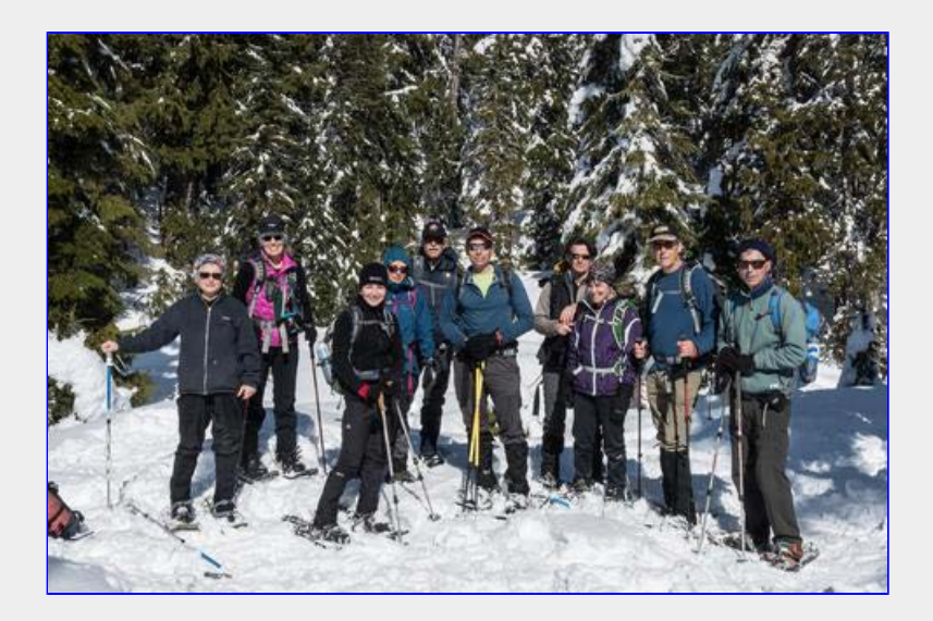
Group shot at our lunch break spot