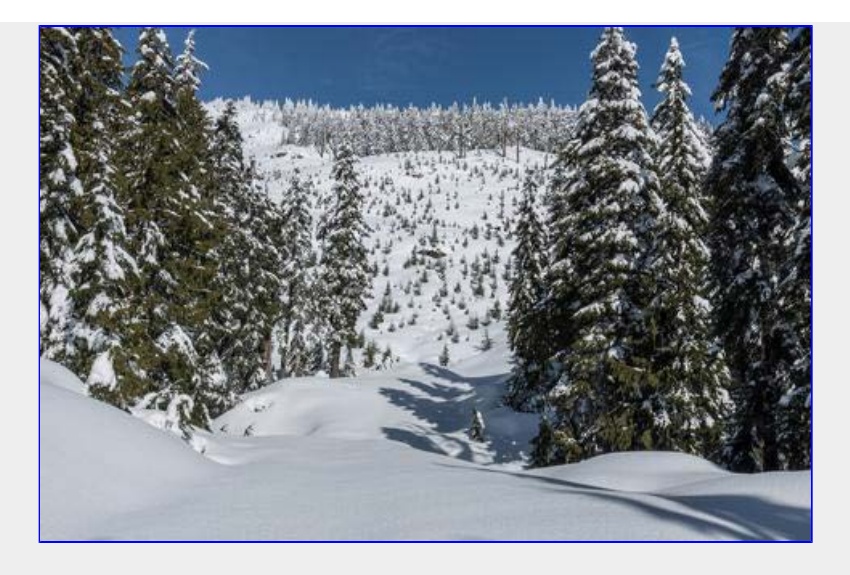
The route that we couldn't take