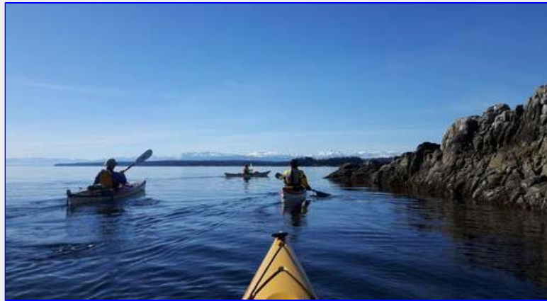
Dunterville islet with VI in background