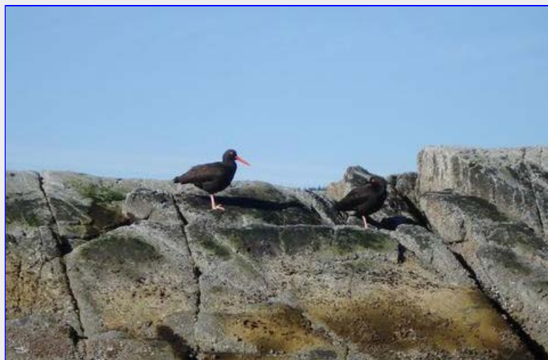
Oystercatchers on Hoskyn Rock