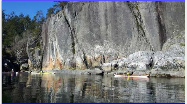
Dunterville islet