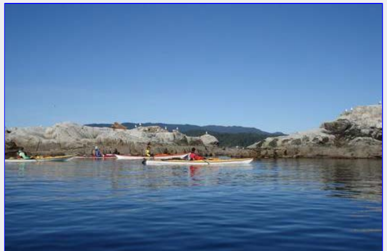
Hoskyn Rock