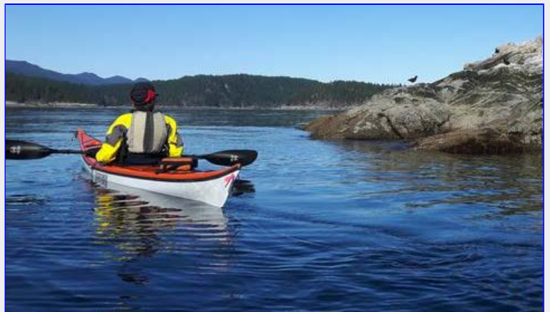
Oyster catcher on Dunterville islet