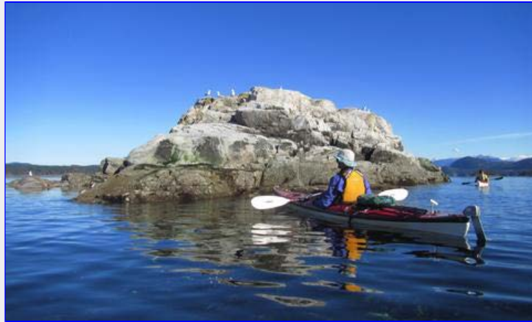
Approaching Hoskyn Rock