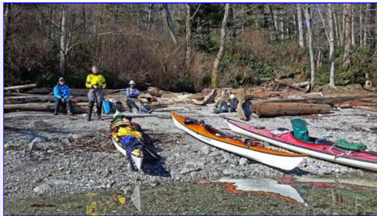
Lunch time