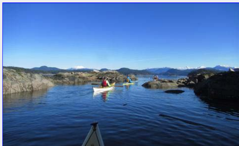
Breton islets

It was a fine day in near perfect conditions. It was a relaxed paddle of 16km.