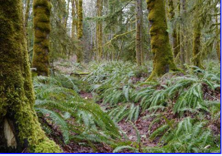
Remnant shape of historic log flume in Morrison Park