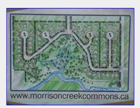
Map of Morrison Commons: nature trail between houses & Morrison Creek wetlands (properties on left half are not yet developed)