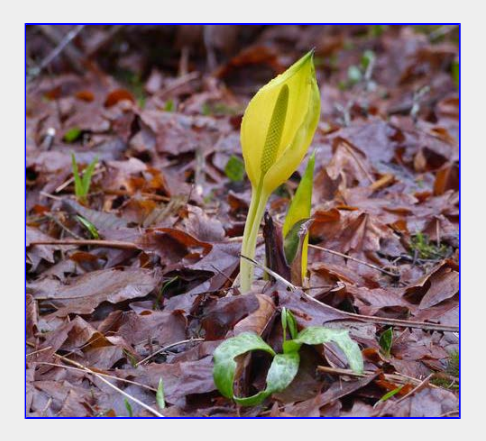
Swamp Lantern & Fawn Lily leaves in Masters Greenway