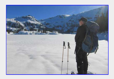
Moat Lake