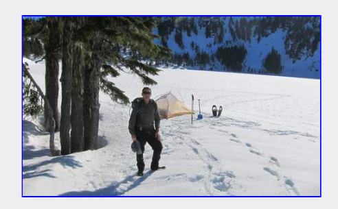
Camp at Circlet lake