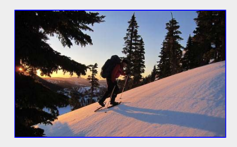
Early morning start on the winter route