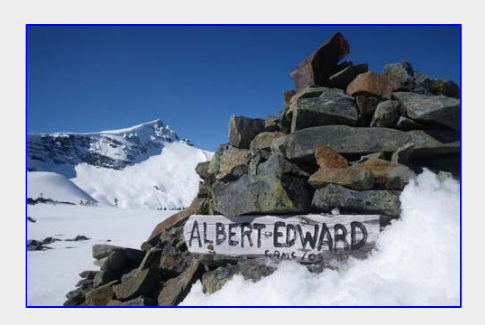
CDMC sign