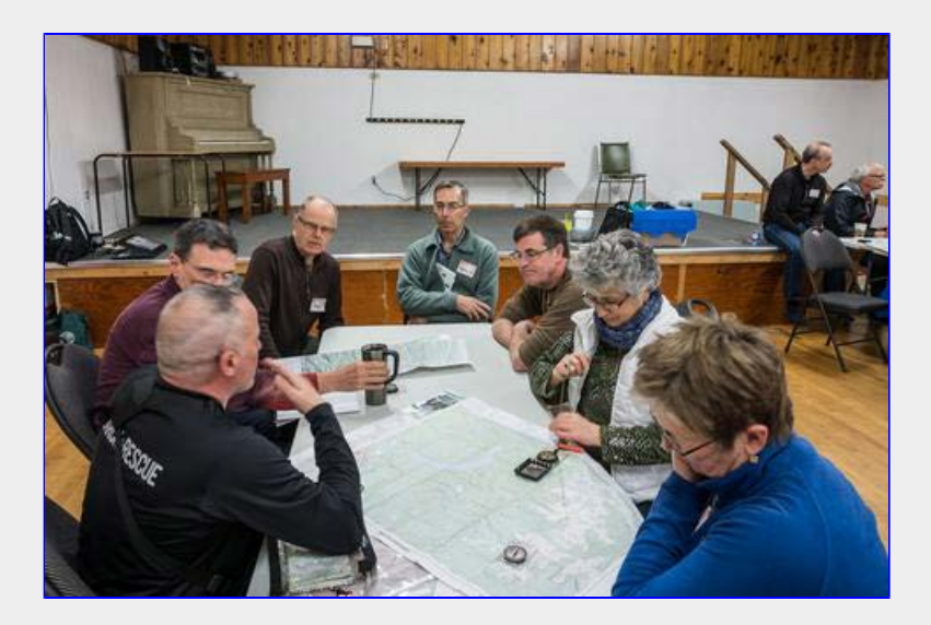
Learning how not to get lost in the mountains