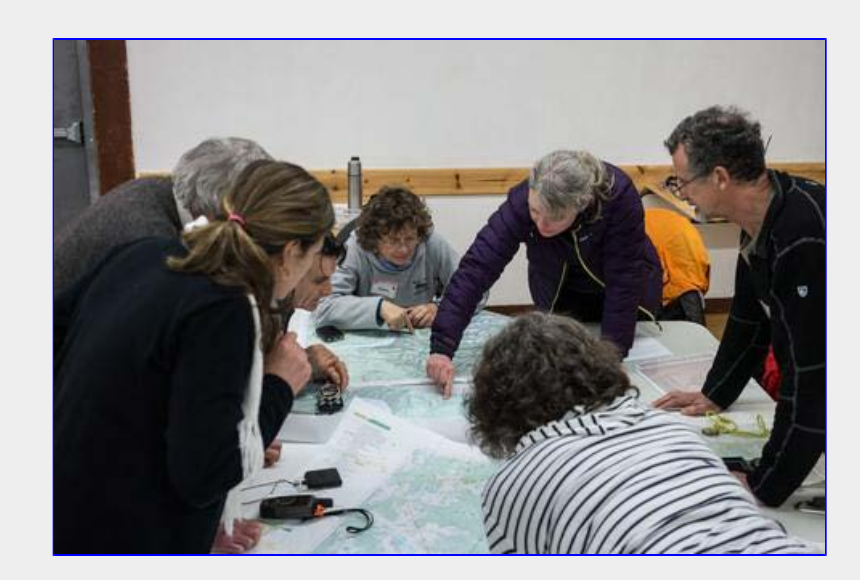
Getting down to business