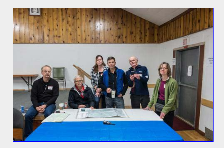
Map and compass session with the assistance of CVGSAR