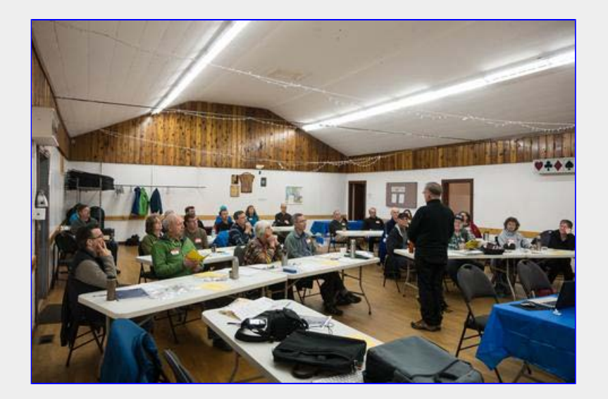
The Fallen Alders Hall worked out very well for our weekend workshop