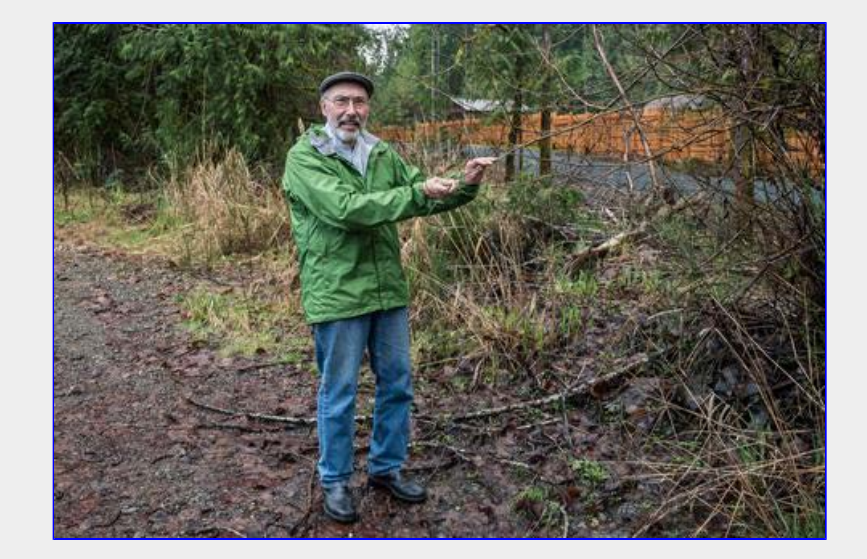
Recognizing tree species