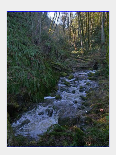
Lower Ravine Waterfall