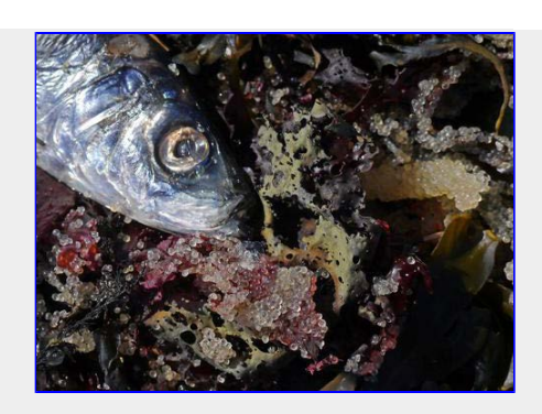
Herring & Roe at Point Holmes