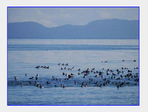
Bufflehead at the Beach