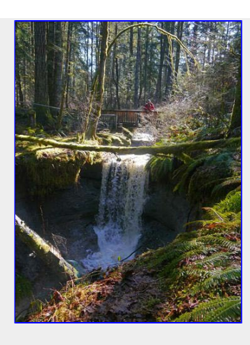
Upper Ravine Waterfall