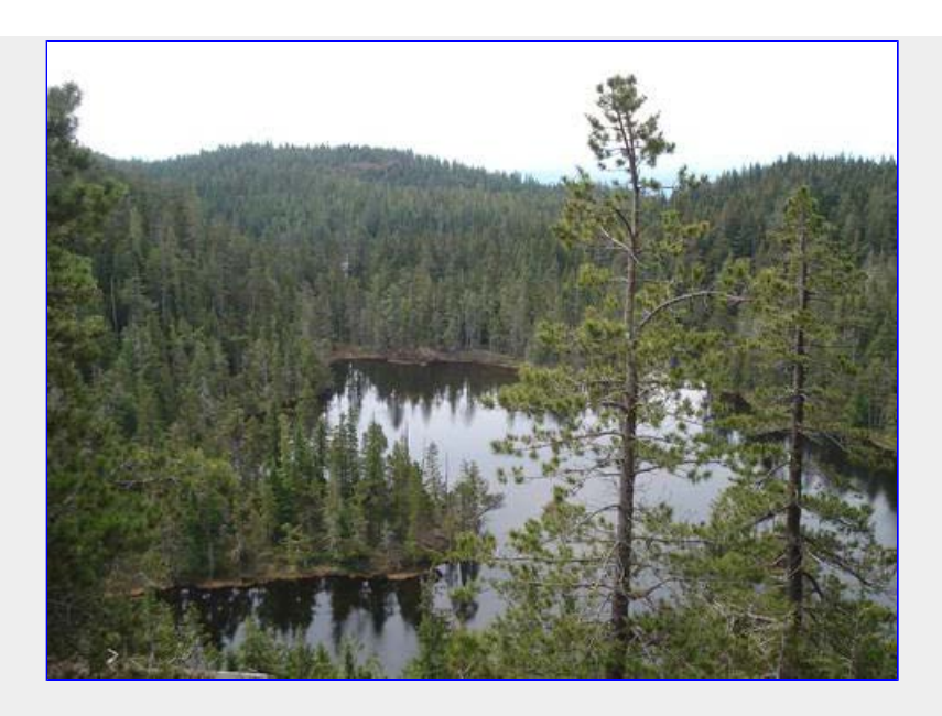
Nearing the Seymour summit