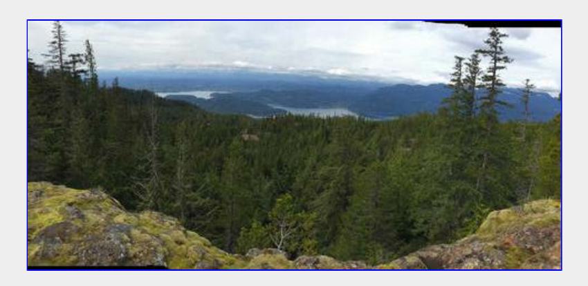
Seymour Narrows