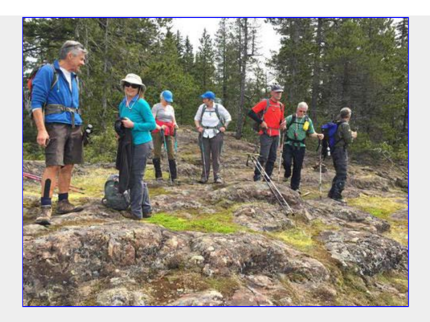
Happy, happy hikers!