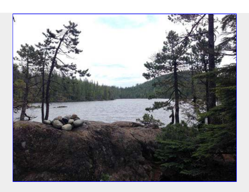
Tom Thomson country