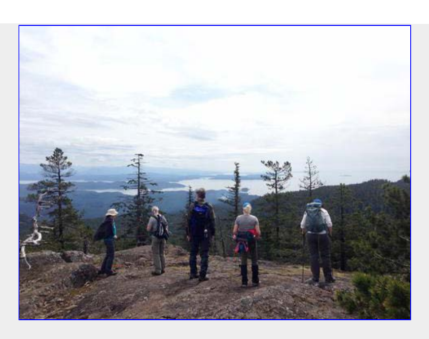
Enjoying the view