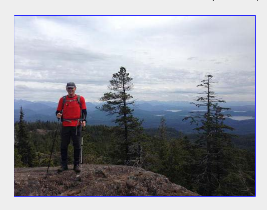
Enjoying a peak moment