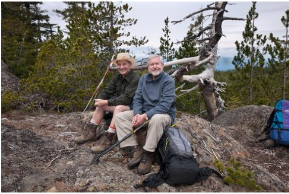
Two happy hikers