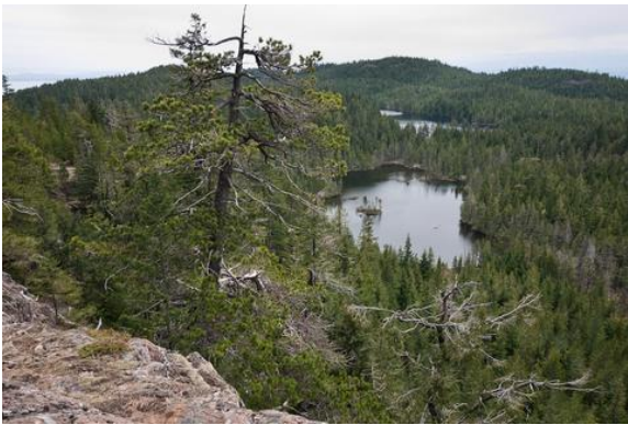
Looking down onto Nugedzi Lake