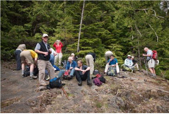
First break after slogging up the logging road