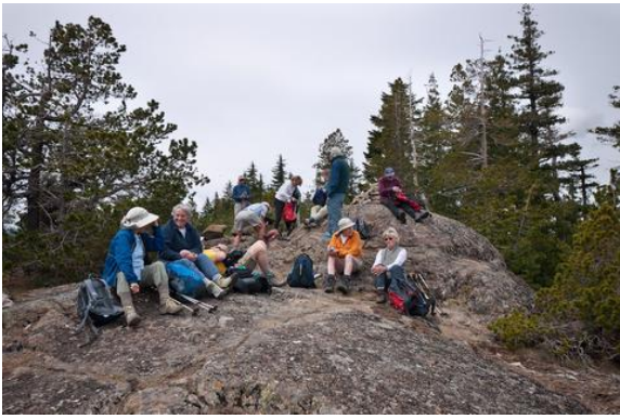
Lunch break on the summit of Mount Seymour