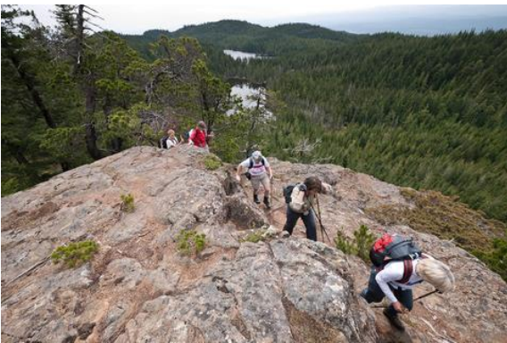
Heading towards Mount Seymour with Nugedzi Lake in the background