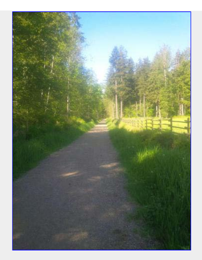
[Juanita Wells photo]