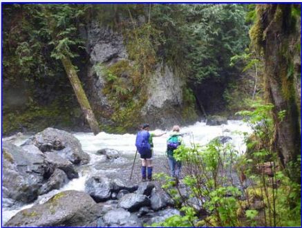
Taking a look upstream at the falls