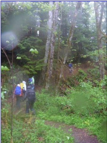
On the way back