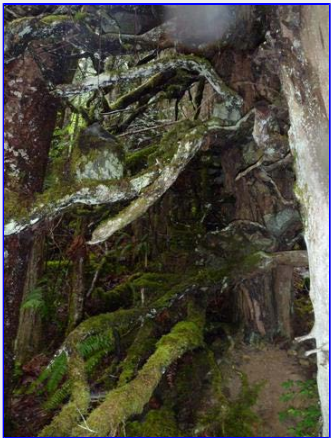
We found this interesting