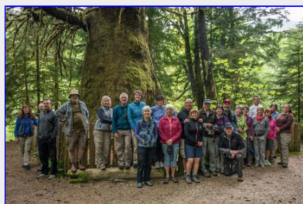
Big tree group shot