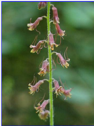
Piggy-back Plant (Tolmiea menziesii)