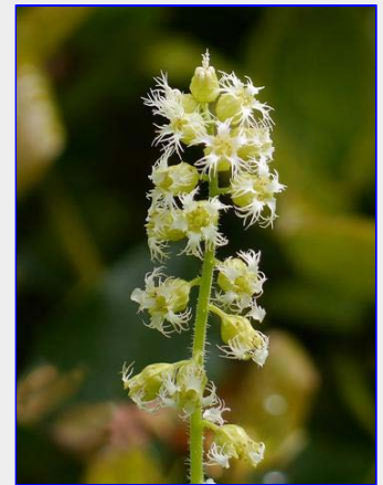
Fringecup (Tellima grandiflora)