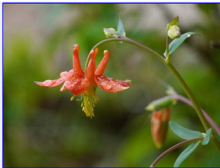
Red Columbine (Aquilegia formosa)