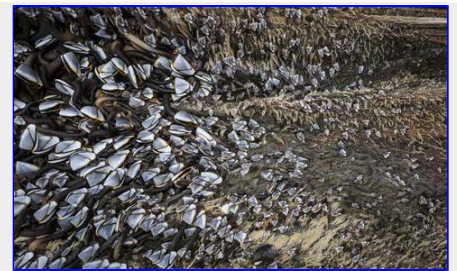
These barnacles look like an advancing army !