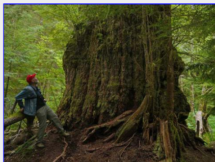
Red Creek Fir (world's largest Douglas-fir) 4.3m dia. Estimated 750-1000 years old.