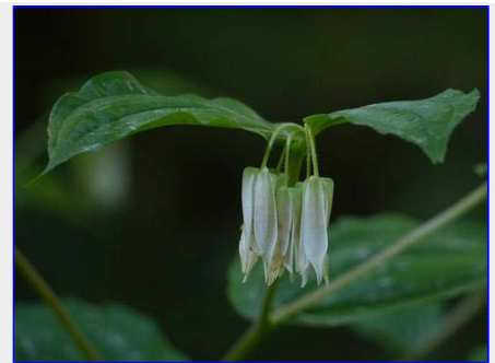
Smith's Fairybells (Disporum smithii) rare in BC