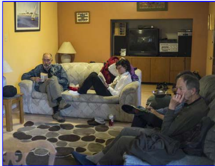
A quiet evening at the Ritz