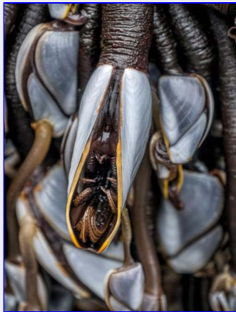
More like aliens from sci-fi movies