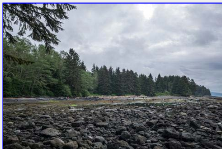
On Botanical Beach