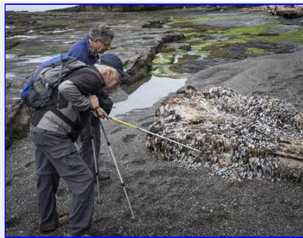
An interesting discovery on the beach. Stump and Goose Neck barnacles