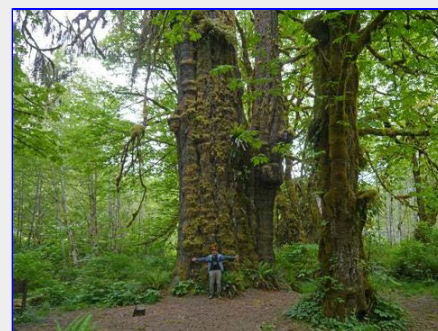
San Juan Spruce (Canada's largest spruce) 3.7m dia.