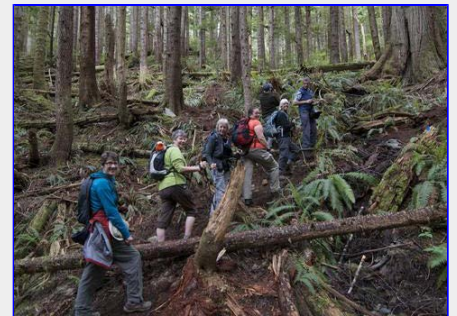
Avatar Grove on the uphill side of the road