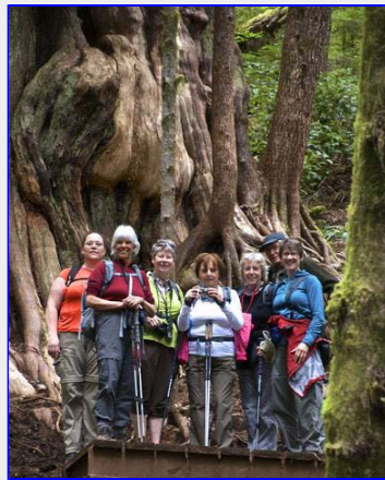
Big tree group shot