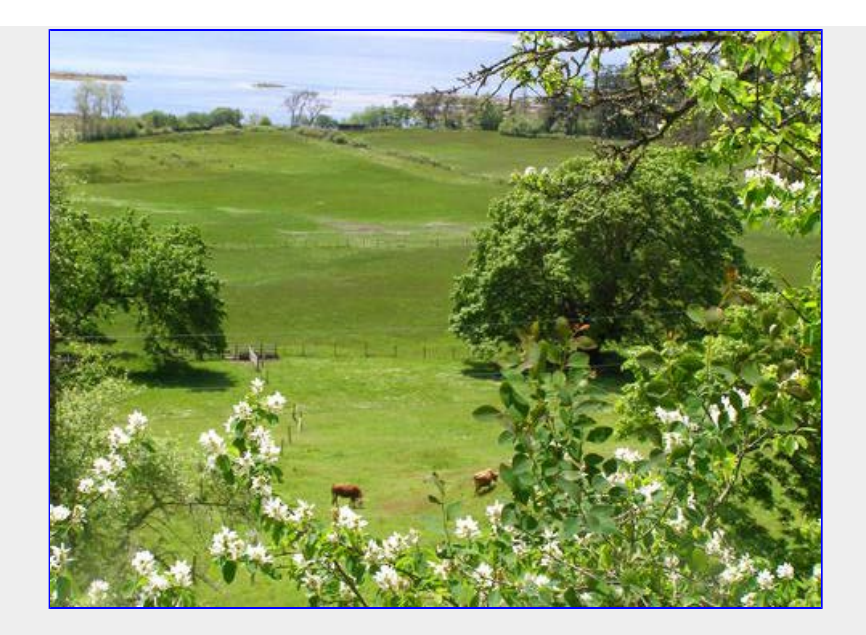
Beautiful farms with a fresh green colour