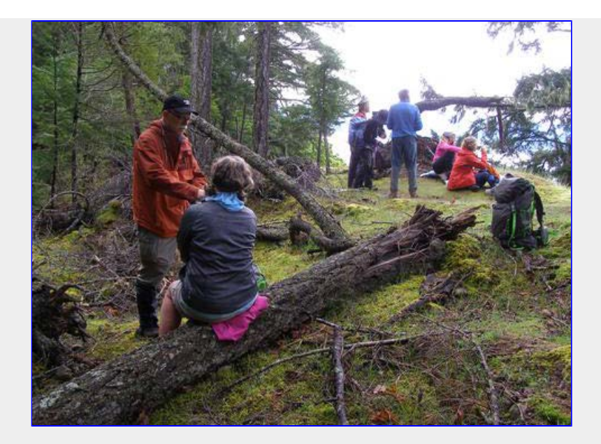
A short brake for a snack