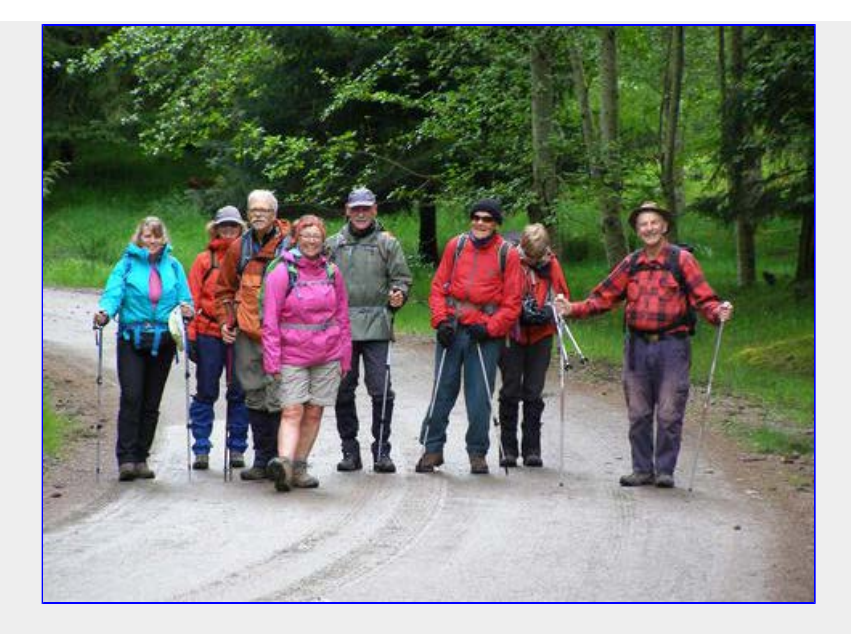
Just the beginning of our beautiful hike