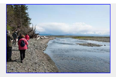
Fast flowing Oyster River