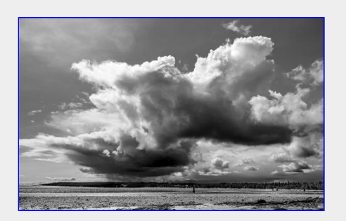
Stormy clouds to the south