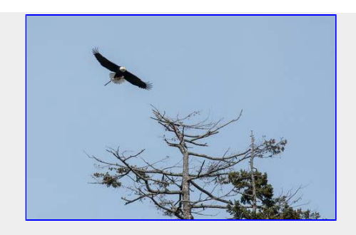
Eagle that seems to be a bit late in the season to be building a nest