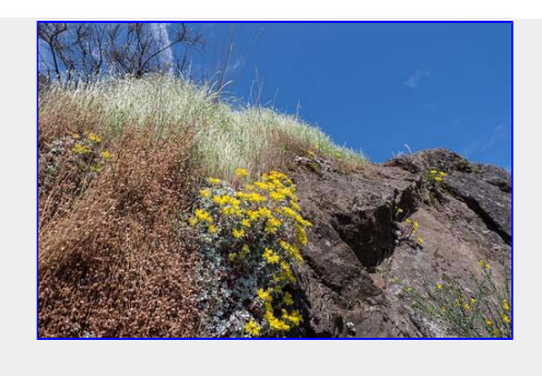
Broad-leaved stonecrop (Sedum spathulifolium)