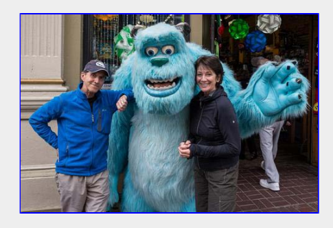
Monsters that we met in Victoria