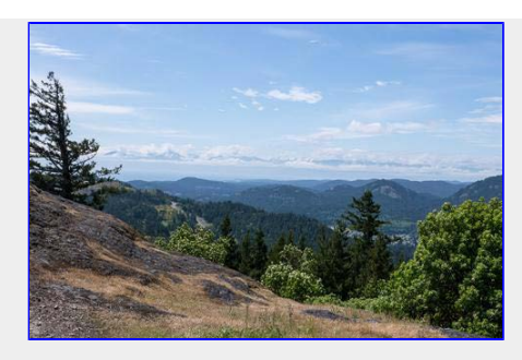
View from near the summit