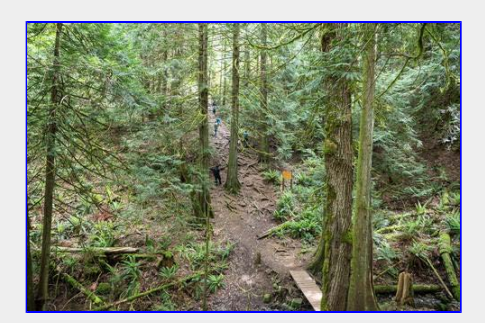
At the beginning of the climb