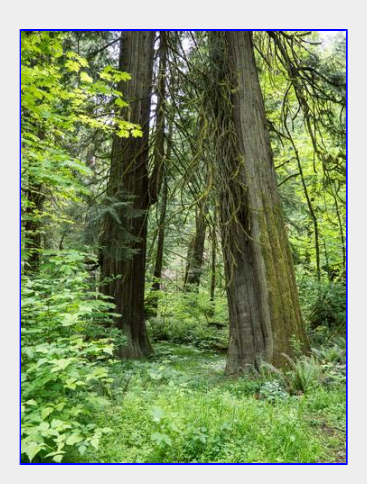
Giant old growth Cedar Trees in Goldstream Park