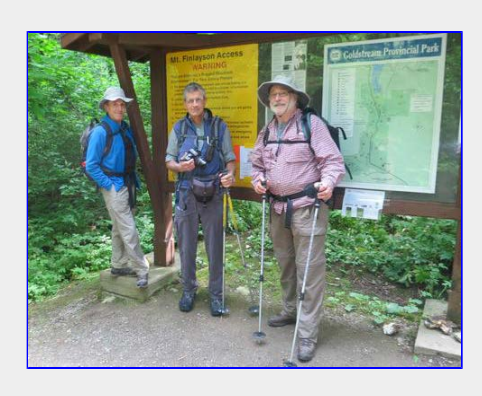
At the parking area