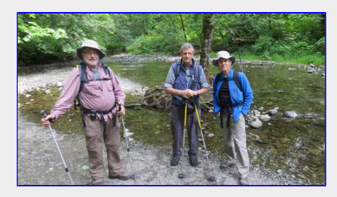
Ready for some exercise