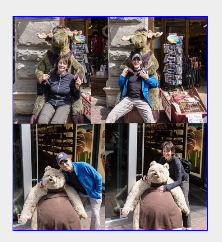
Other friendly animals on the sidewalk