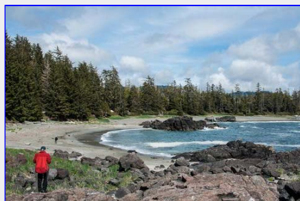
Looking across Wya Bay from the north side rocks