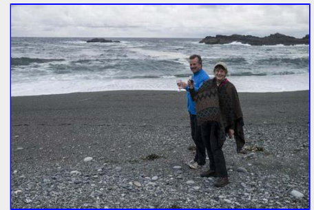
Another view on Wya Beach !