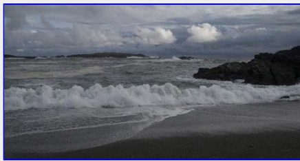
Wya Point Beach in evening