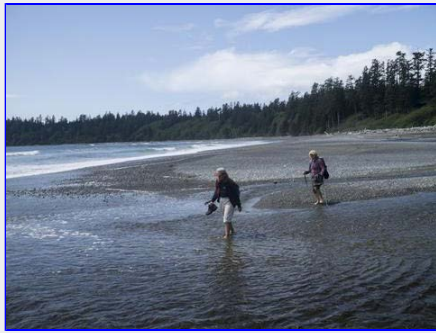
Wading Stream on Florencia bay