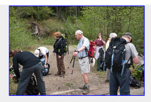
Morning stop for coffee break