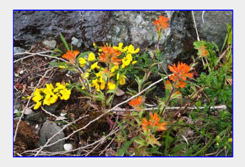
Contrasting colours with Broom and Indian Paintbrush