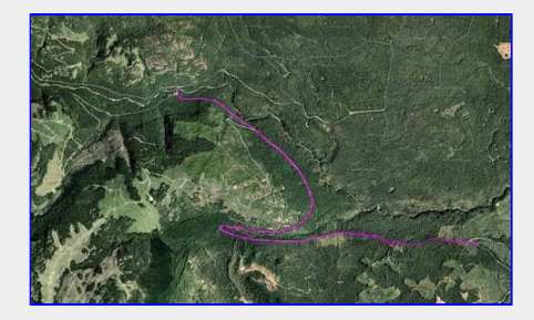
Upper Browns River route satellite overlay