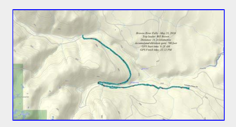
Upper Browns River GPS map

A Sunday crew of 20 headed out (with a few new faces) under clearing skies but as the real mountain folk that we are, we were not fooled by this early sunshine... eventually the Rain-forest did have it's way with us and we were forced back from our destination by the liquid sunshine. We did manage to enjoy a pleasant stroll along the lower eastern flank of Forbidden Plateau, travelling north off the Forbidden Plateau Road onto an old logging road, through the Wattaway Valley and into the Brown's River Valley. Enroute we had the privilege of a wildlife encounter... momma bear and her cub crossed over the front of our crew (always a thrilling moment)! Paintbrush coloured the sides of our pathway and despite the showers, many appreciated the visit to new terrain and all, seemingly, had a great time amongst the banter of our group... Good day, Bill and thank you.