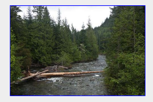
Looking downstream at bridge over Browns River