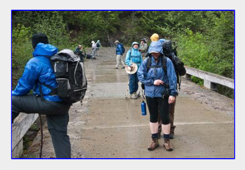
Time for rain gear and turnaround point