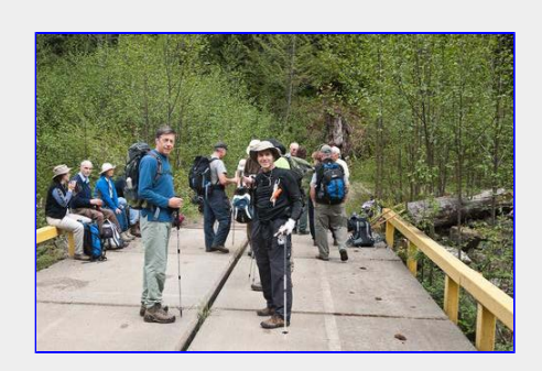
Logging bridge over Wattaway Creek