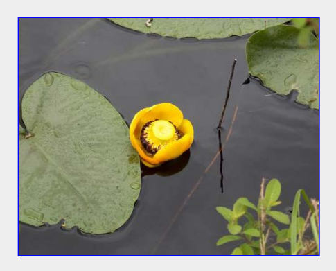
Up close