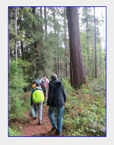
Returning to our cars