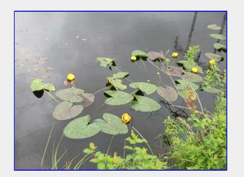
Wow! Lillies?