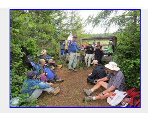
A well deserved lunch break