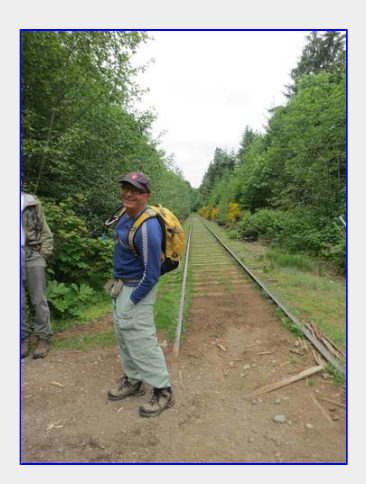
Crossing the tracks...