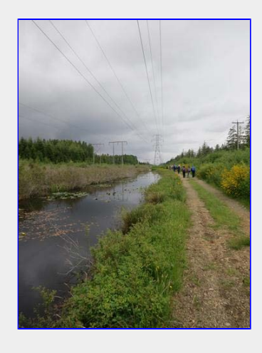
The canal