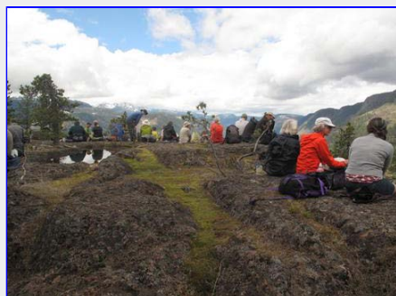
Lunch at the summit