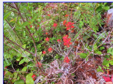
Paint brush in clear cut area