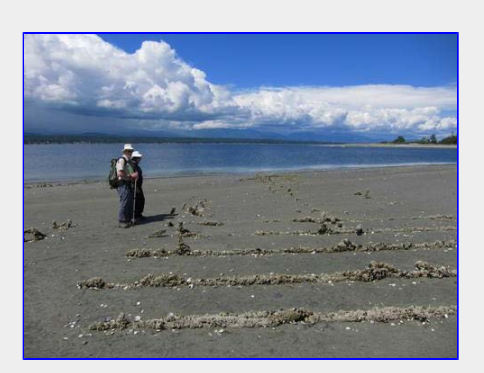
examining shipwreck bones