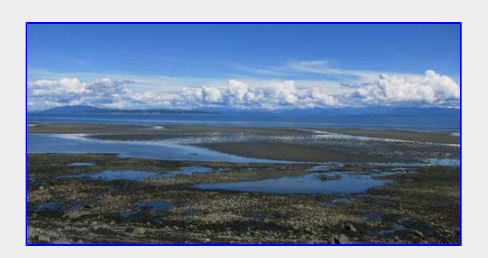
A view across the strait on a very low tide