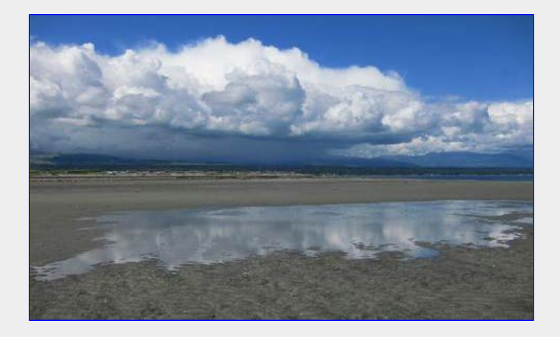
A view towards the "Big Island"