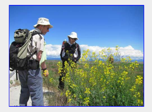
Yellow, but no signs of broom bloom