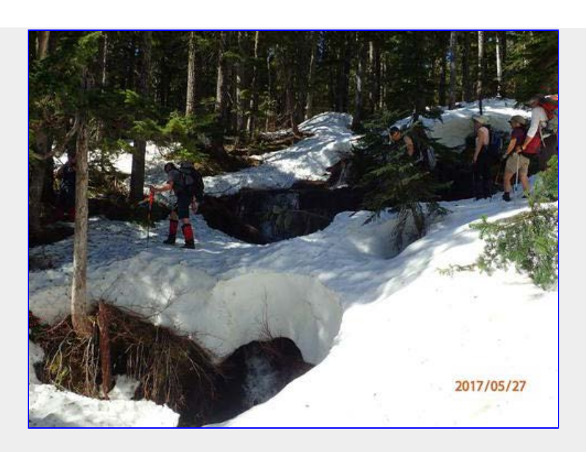
Does the snow bridge is holding us all?