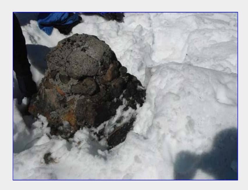
The memorial cairn, dug out a bit.