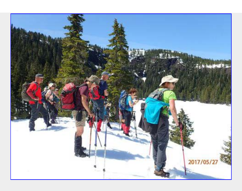
Our destination.