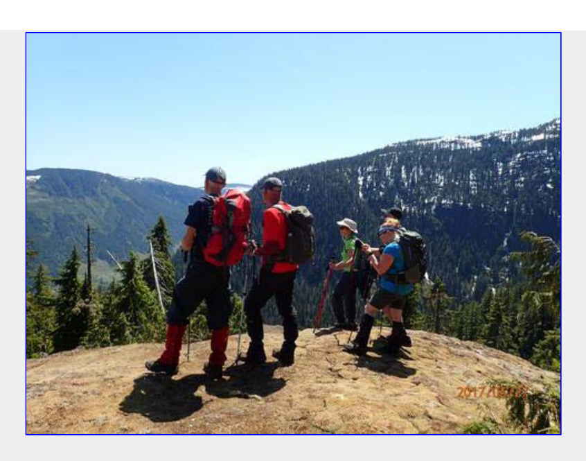
On the way down, georgeous views and it is hot.