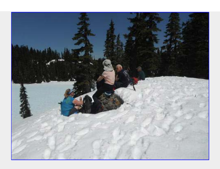
You can see the top of the memorial cairn sticking out of the snow.