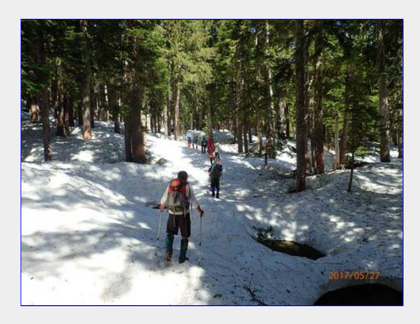
Almost there yet.