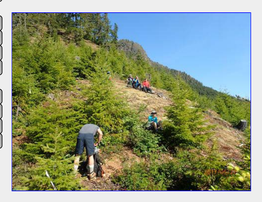
Up, up it goes!

We got to Idiens Lake at 11:50 am. The memorial cairn was mostly buried in the snow, with just the top sticking out. Our elevation there was 1,050 meters. The lake was still frozen, with some blue color around the edges. Everyone found a spot for lunch. We left at 12:35 pm, heading out the same way in. With some more "mini breaks" on the way out, we were down at the trucks by 3 pm. Driving back along the Comox Lake road was a dusty one. Back at Harmston Ave. by 4 pm. A sun filled day was had by all. Thank you to the members who came out.