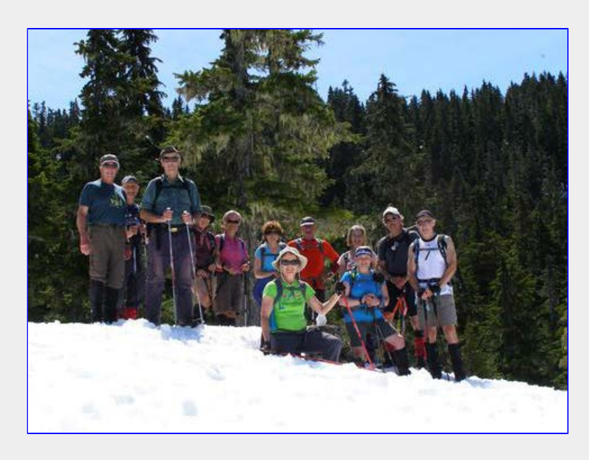
We all made it to the summit