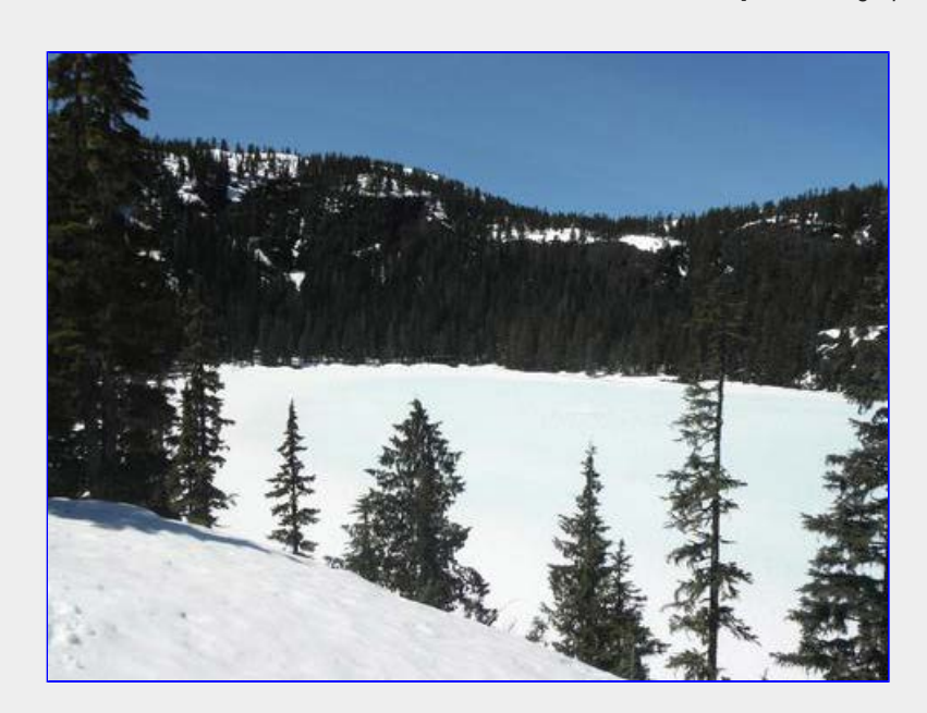
Idiens Lake on May 27th. 2017.