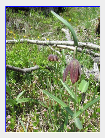
Chocolate Lily [Linda Hamilton photo]

View down to Comox Lake [Linda Hamilton photo]