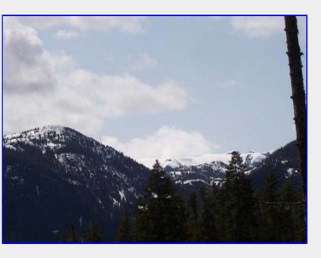
Comox Glacier from Western Face

Great weather for the Alone Mt trip - relaxed saunter up to the summit with a few new faces as well as some old surfacing from winter hibernation. Several enjoyed an ice-cream stop at the DQ on our return.