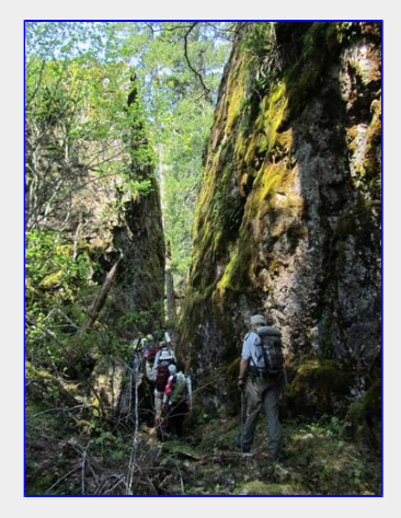
hiking through a passage in the rocks