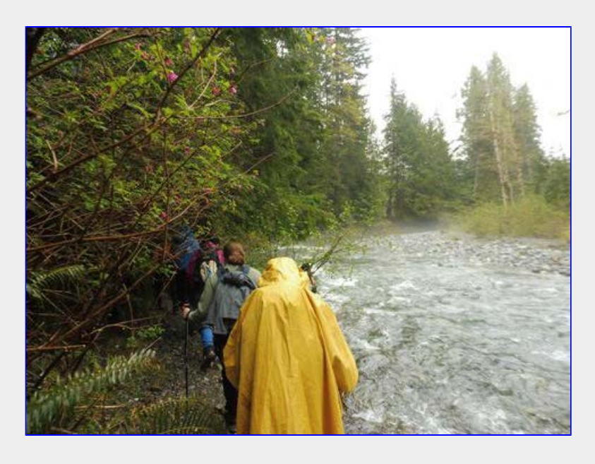
Getting a little misty as we near the highway on our way back