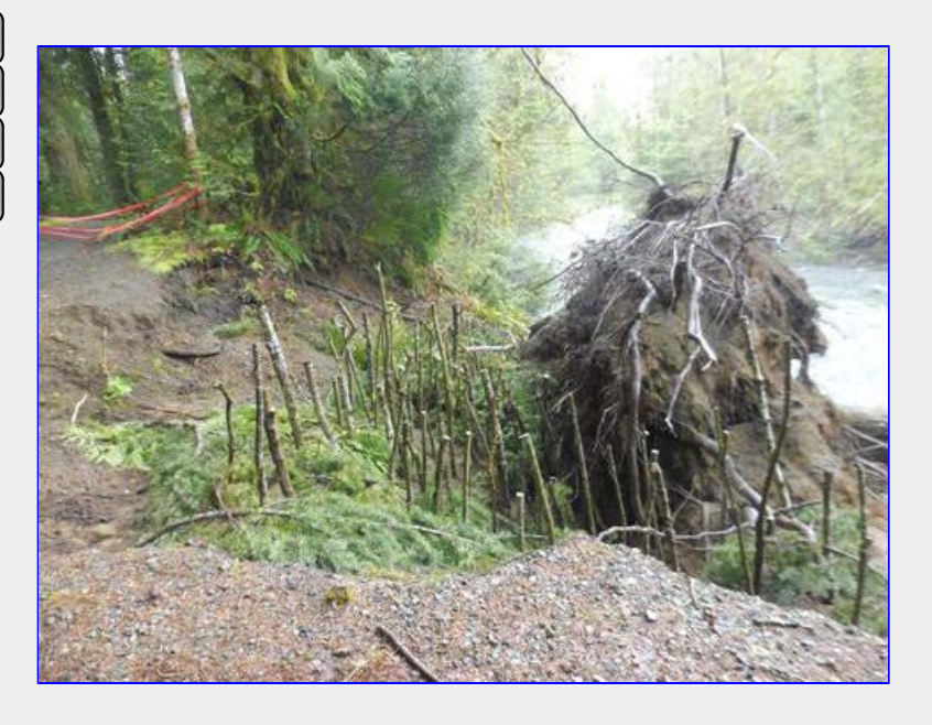
An innovative approach to slowing bank erosion

Another glorious hike! At one point we had 14 on the waiting list, so we increased the limit to 10. By the time hike day day rolled along we had only 8 enrolled. So those of you who are disheartened by the long wait lists, don't be. Keep the date flexible in your calendar and well see you on the next hike!