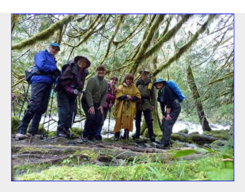
Happy Hikers!