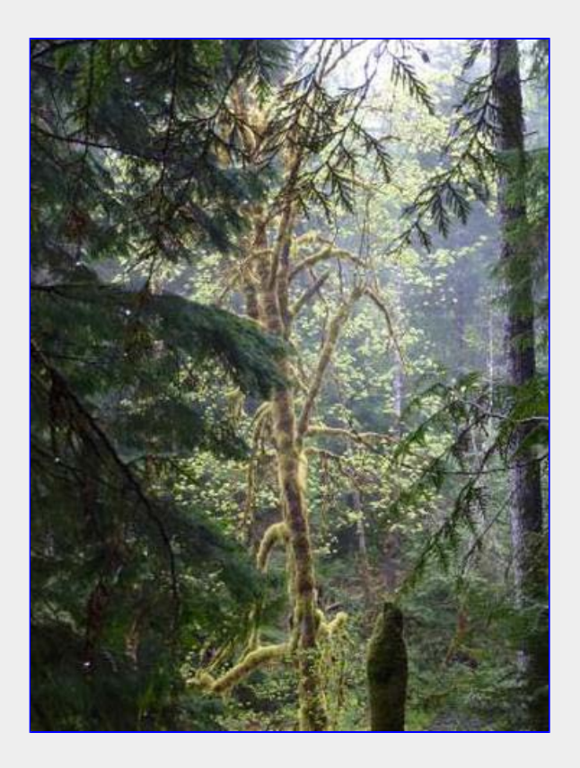
Great to see sunshine