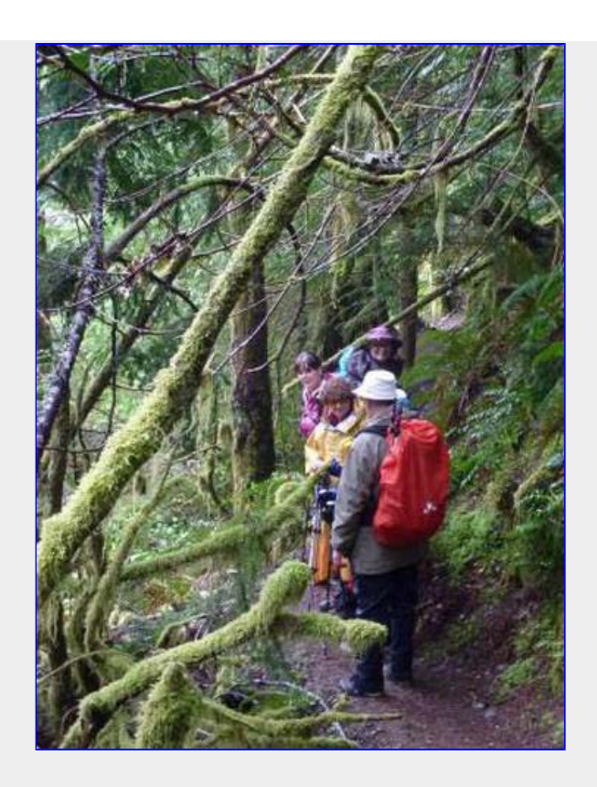
Pausing for a chat