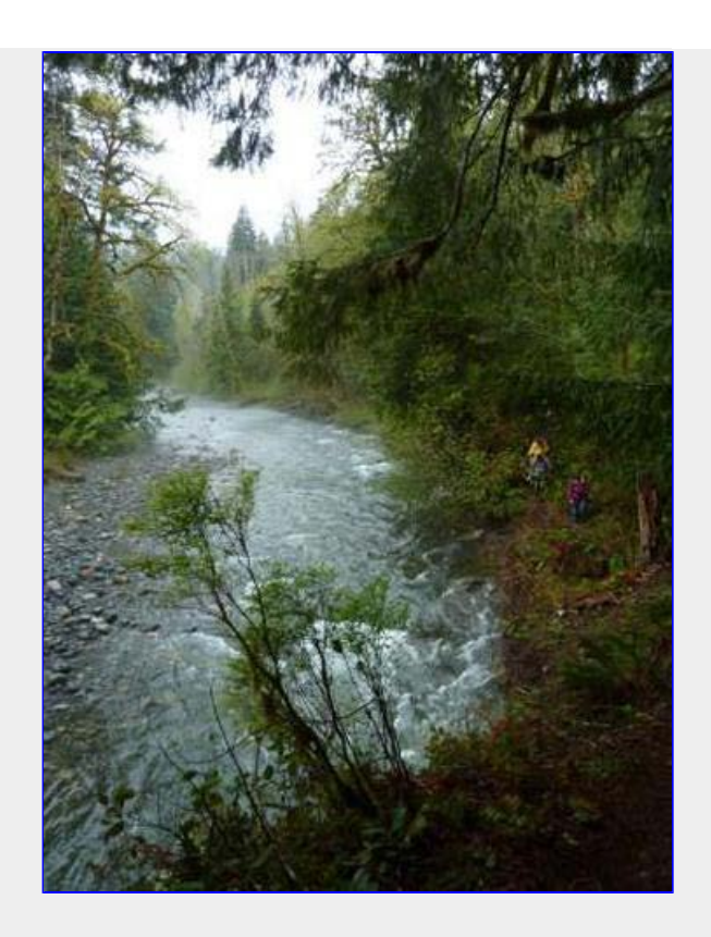
Mighty creek