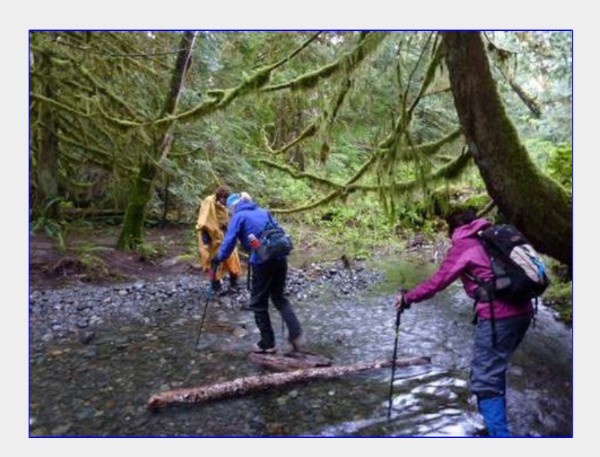
It's a balancing act!