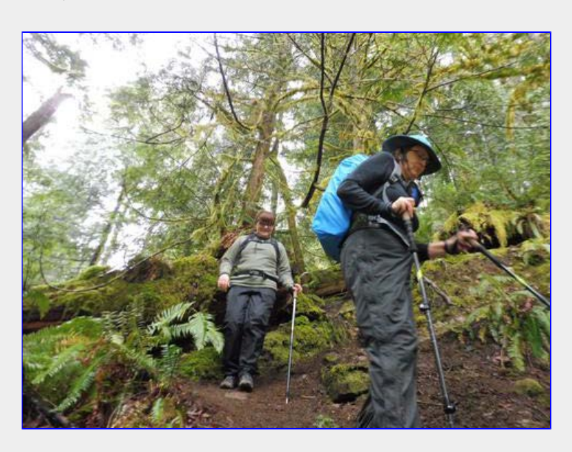
Some of the short steep sections need care to avoid slipping