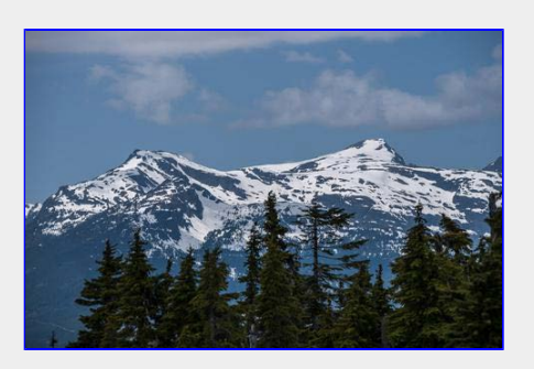
Good view of Frink, Castlecrag and Albert Edward