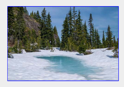
Turquoise colour in small pond before the gully