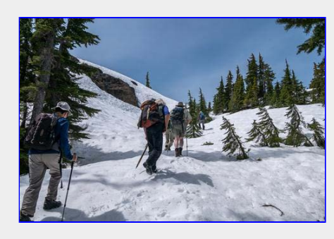
Heading towards the Becher summit