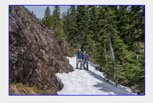
Still snow as we climb up the