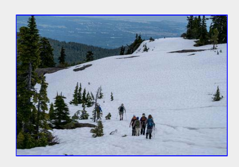
Heading back down on the summer trail