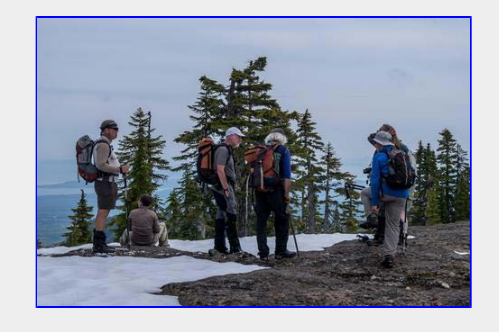
Another short break