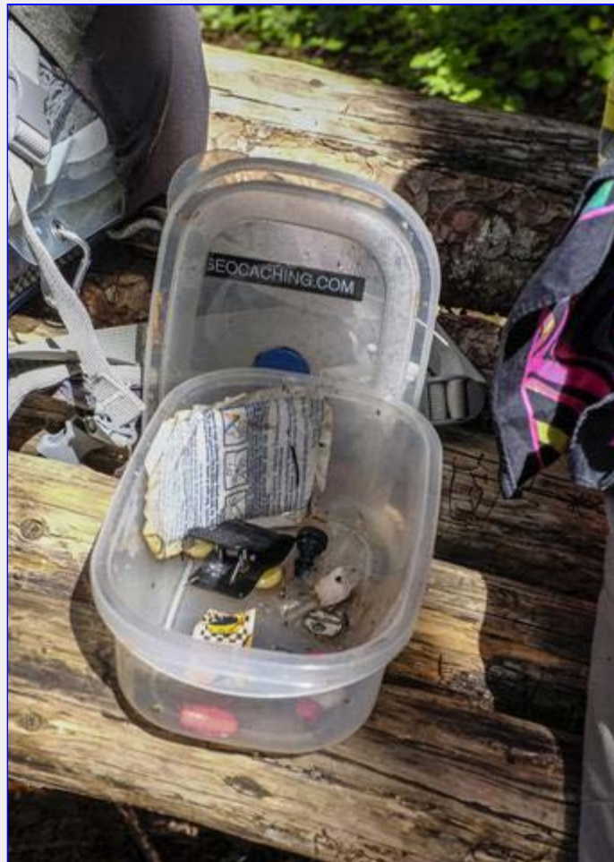
GeoCache Goody Box