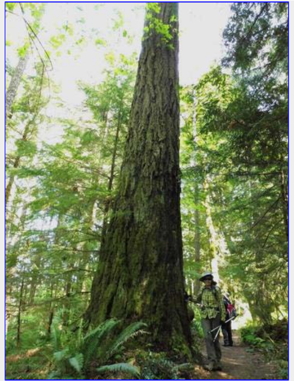
Still a few of these beautiful big firs along the river