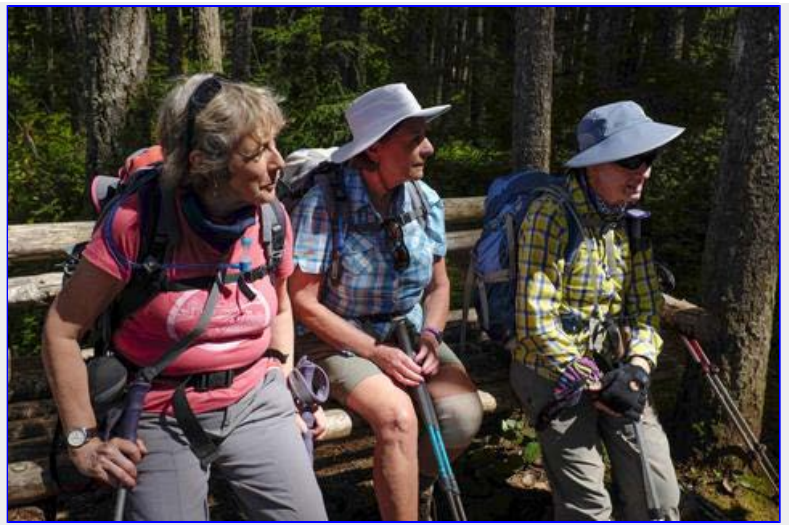
Welcome seat