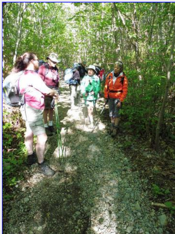
Just getting started

We couldn't believe our luck at the turn in the weather, what a glorious sun-shiney morning. With a bit of a breeze to keep us cool twelve hikers started out from the parking area at the end of Herondale rd in Royston at 9am. After a bit of a meander up the service road to the water tower into the trails we went. Eventually the group connected to the Union Bay Fire Service rd which then led us up to the Van West rd. Here we continued to the right up to the power lines. After a brief chat with a brush clearing crew, everyone headed north along the power lines to our lunch stop at the marsh. Continuing on the power lines after lunch, passing by the turn down Cherry Lane, the turn was finally made onto Moe's Misery. After traveling along side the Trent River for a ways a brief stop was made at a unique wooden bench to admire the view, find a geocache and take some pictures. Carrying on the group finished the trail along the river and headed back along the road connecting back to the water tower arriving back at the vehicles at approx 2pm. Thankyou everyone for such great company and cooperation in keeping everyone together at every intersection.