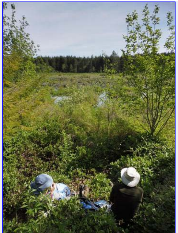
Lunch overlooking the marsh