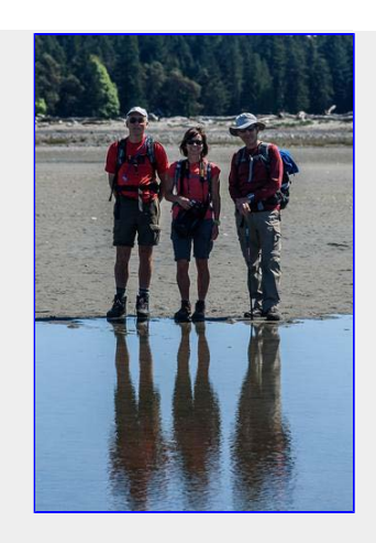
Reflections on a good day