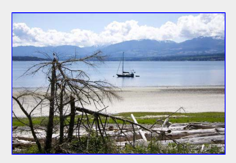
Great place to anchor your boat!