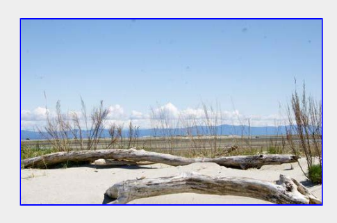
Sit and dig your toes into the white sand