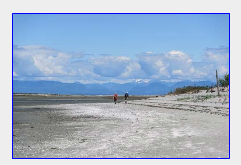
Wide open beaches and great view to the coastal mountains