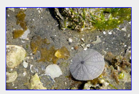
It should have been called Sand Dollar beach