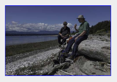
Lunch in the sun

Very heavy traffic on the Denman Island ferry resulted in our group splitting into two parties for the hike over to Tree Island. Happily we all met up for lunch at TI. Plenty of wild flowers to be seen(larkspur) and a beautiful sunny spring day. We met another group of well organized hikers who were enjoying oysters and wine and other gourmet delights for lunch. We hiked back to Gladstone Rd. more or less together. A great day.