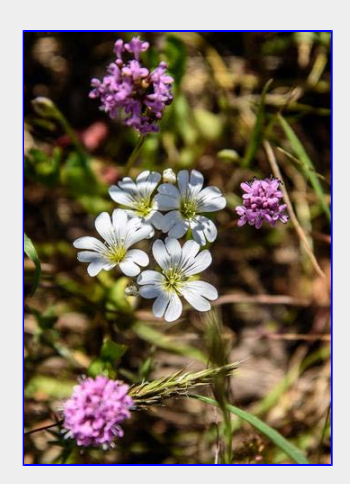
Seablush and Meadow Chickweed?