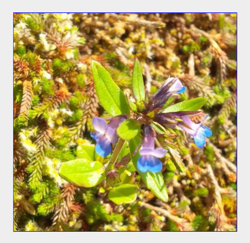
Happy flowers!