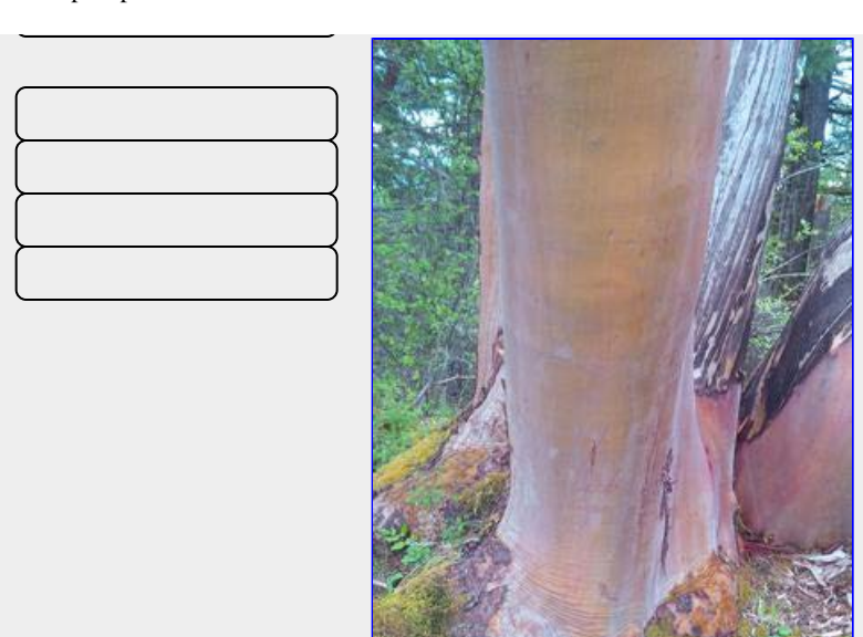
Elephant foot