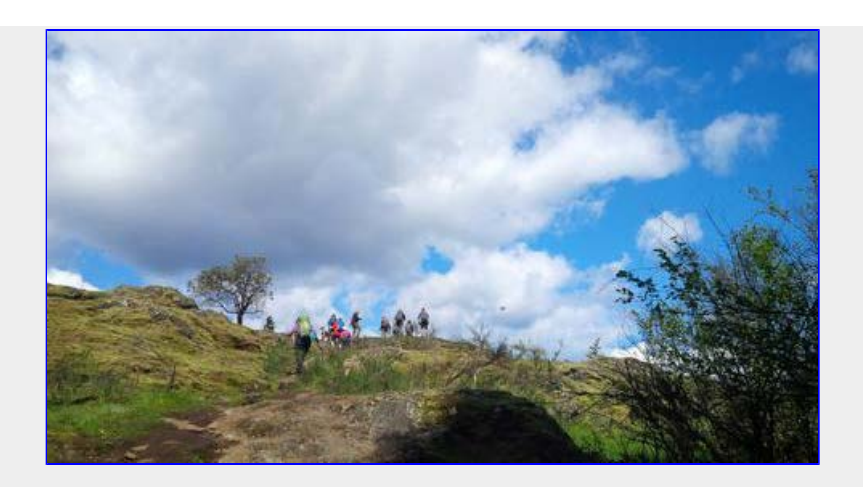
Heading for the sky!