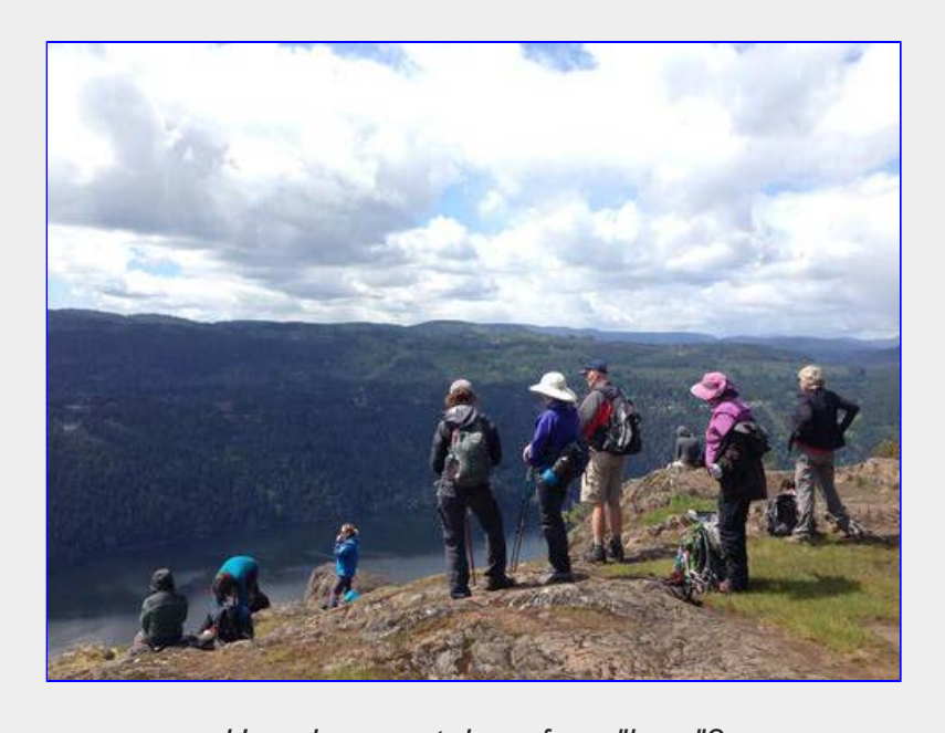
How do we get down from "here"?