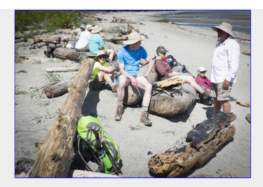
Lunch Time