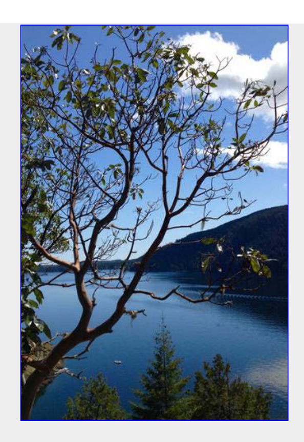
Artubus Beauty