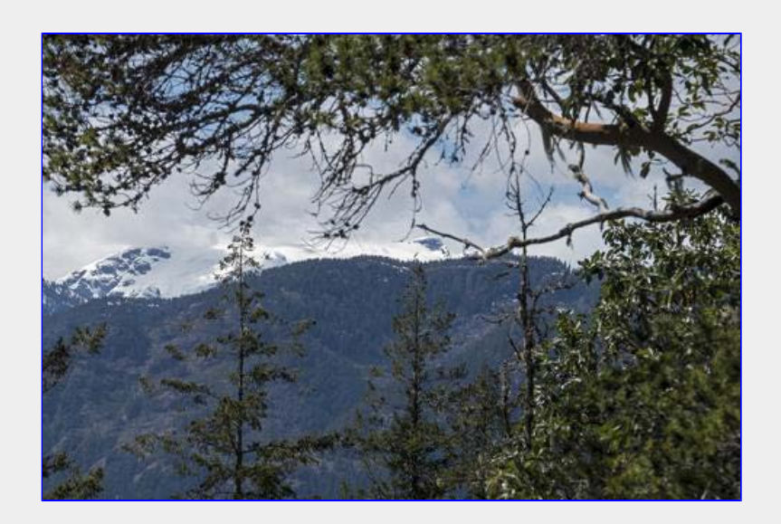
View of Comox Glacier from the Comox Bluffs