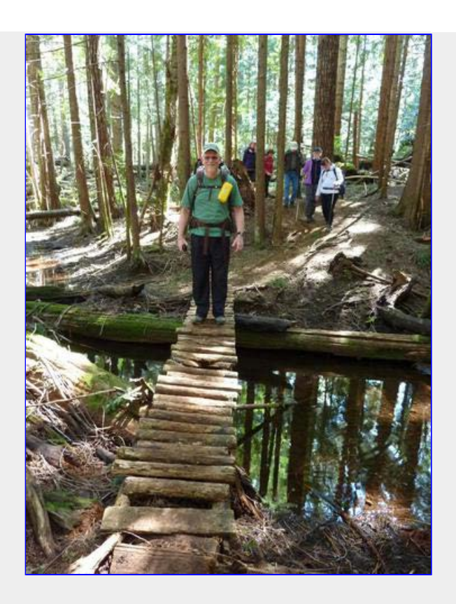
Varied path