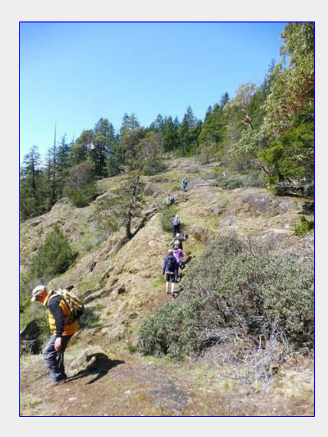
Approaching our lunch spot on the bluffs