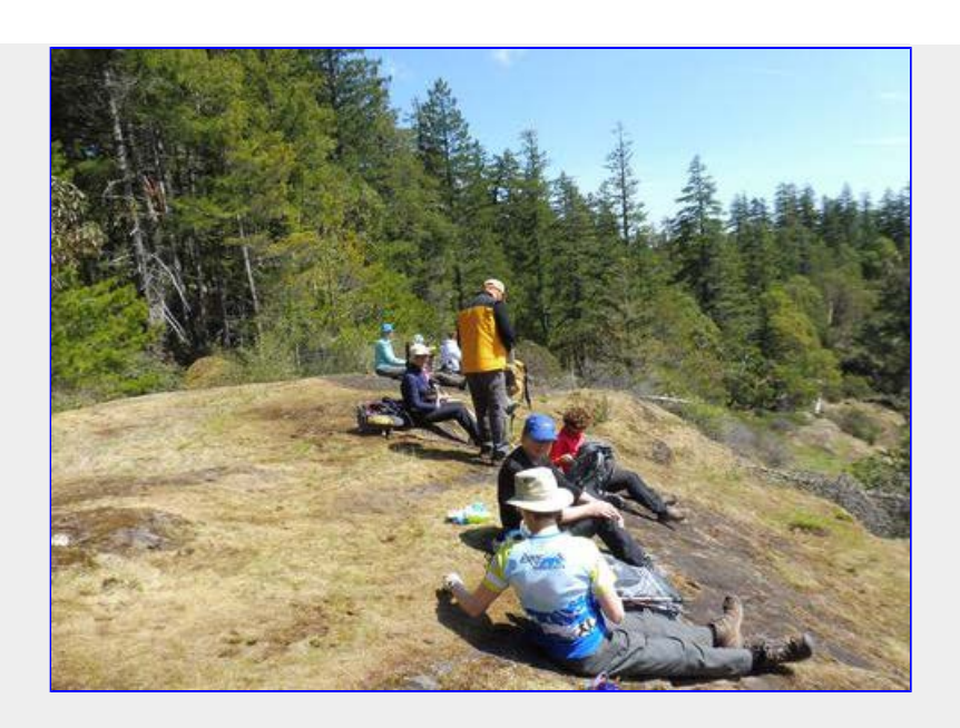
Enjoying lunch on the bluffs