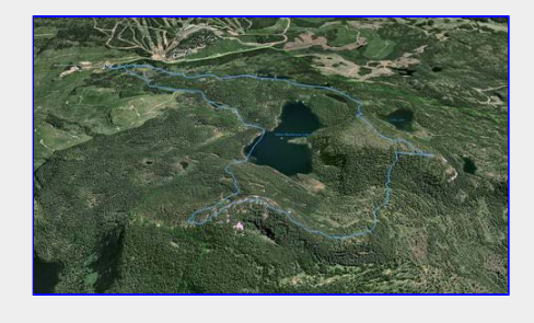
GPS satellite overlay