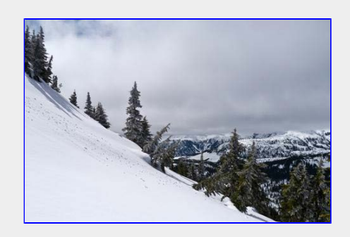
Still snow on the trees