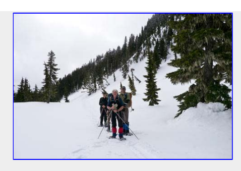
Part way up the north side of Mount Allan Brooks