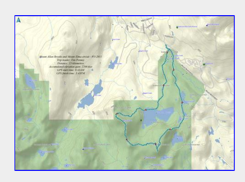
GPS map

A few more photos are available for viewing.