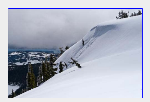
Last stretch of the ridge to the summit of Alan Brooks