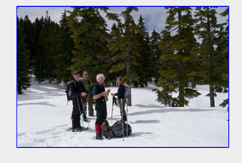
Last stop at the north end of Battleship Lake