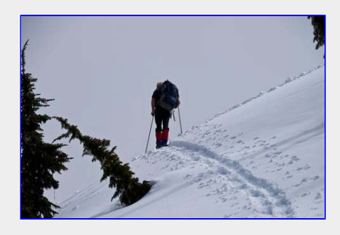
Karl, breaking trail