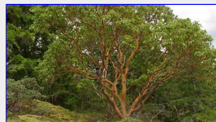
Arbutus in spring colours