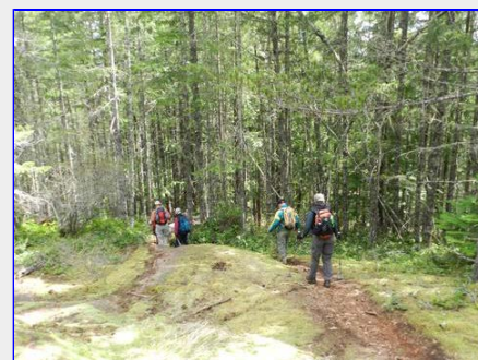
through the woods and up and down we go