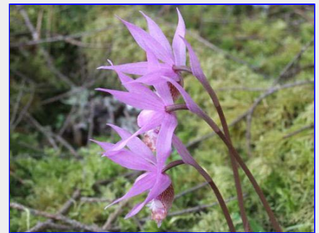
Calypto Orchids in the Ecological Reserve