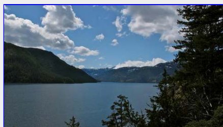
Spectacular Glacier Views