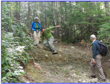
Slippin' and slidin'