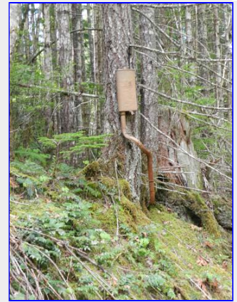
Rough roads in these parts