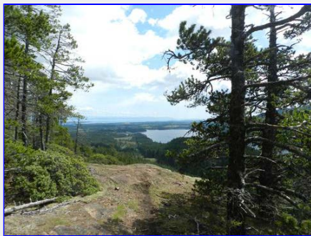
Spectacular views of Comox Lake and beyond