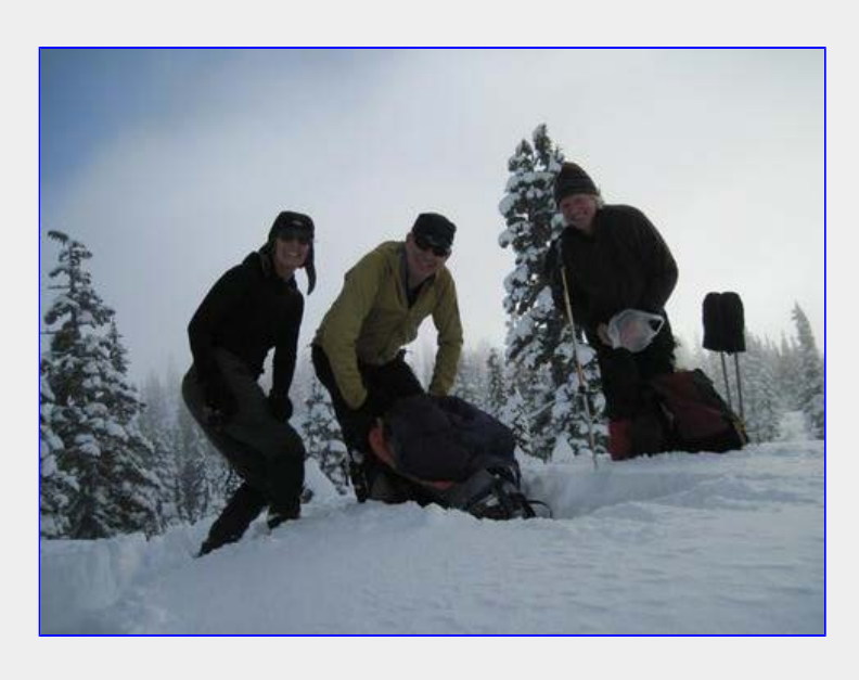
Lunch on Croteau Hill