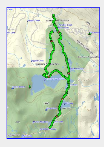
Our route, 13.5k