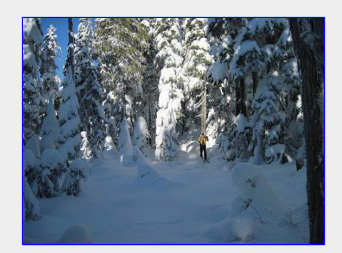
Bob coming up the trail