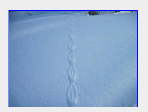
interesting tracks in the snow