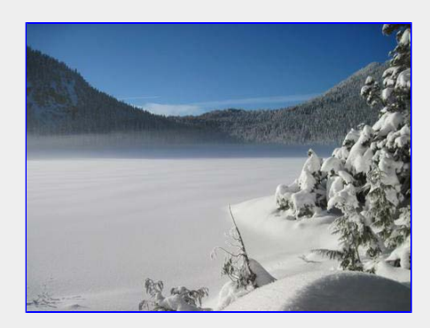
A light mist on Lake Helen Mackenzie