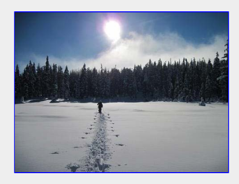
Karl crossing Croteau Lake