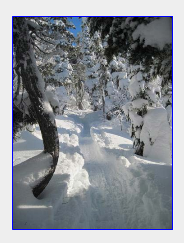
Lots of fresh snow